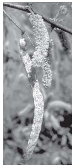
Mesquite flowers and seed pod