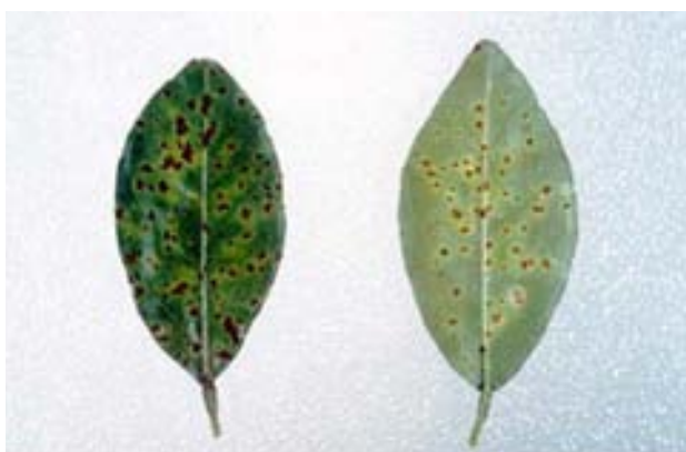
Copper damage on leaves

Copper sprays can cause dead (necrotic) spots between the oil glands giving the fruit rind or leaves a speckled appearance (stippling). These spots