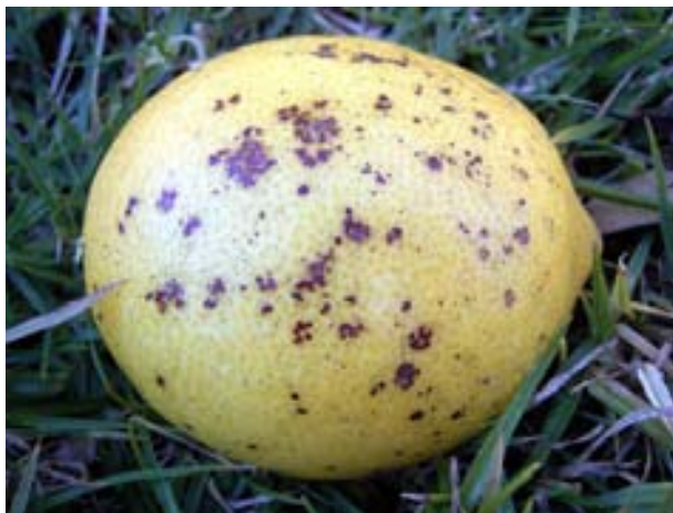
Copper damage on fruit

appear similar to those of the disease melanose but the spots are almost black and are often on the exposed (outward facing) surface of the fruit. Copper sprays also darken existing blemishes (e.g. wind blemish on fruit).