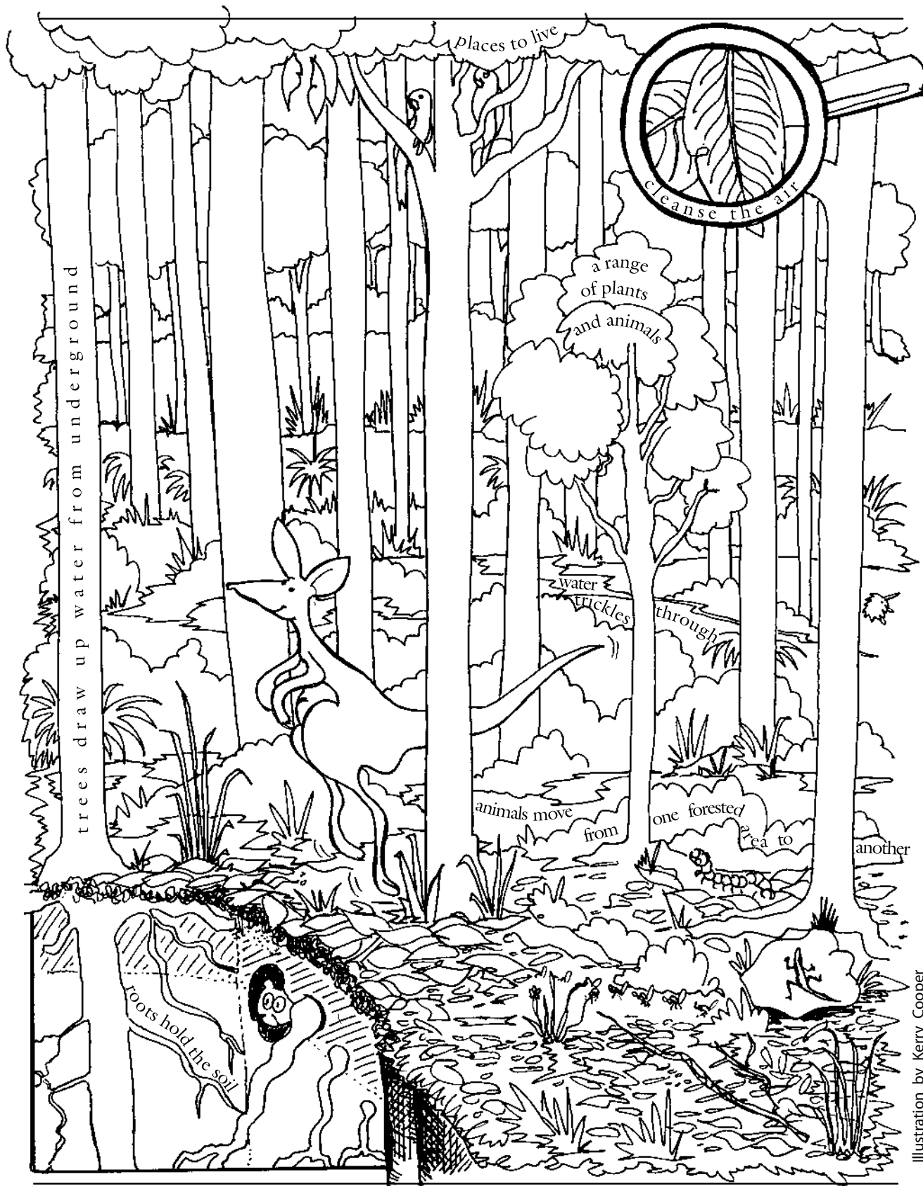
Illustration by Kerry Cooper

Discover six planted forest features in the picture below. Colour the picture, paste it onto cardboard, then cut it into six interesting shapes to make a jig saw puzzle.