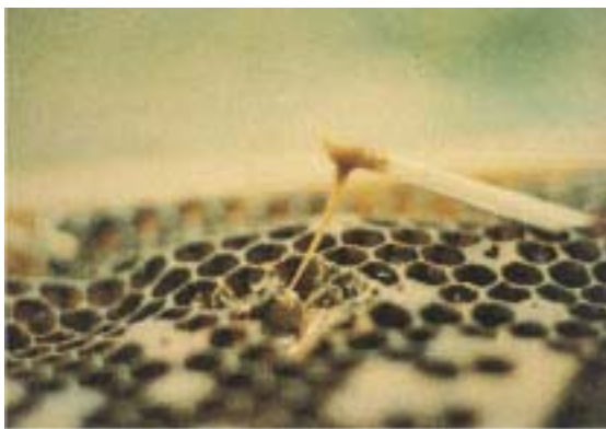
Figure 4. When the larva first dies the diseased material ropes or strings out when touched with a match. Later the diseased material dries to form a black scale.