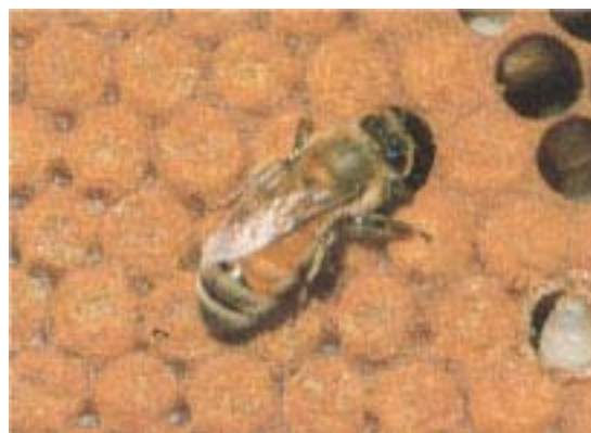
Figure 1. Healthy sealed brood. American foulbrood affects the sealed brood stage. One cell has the capping removed to show the age at which most larvae die from the disease.