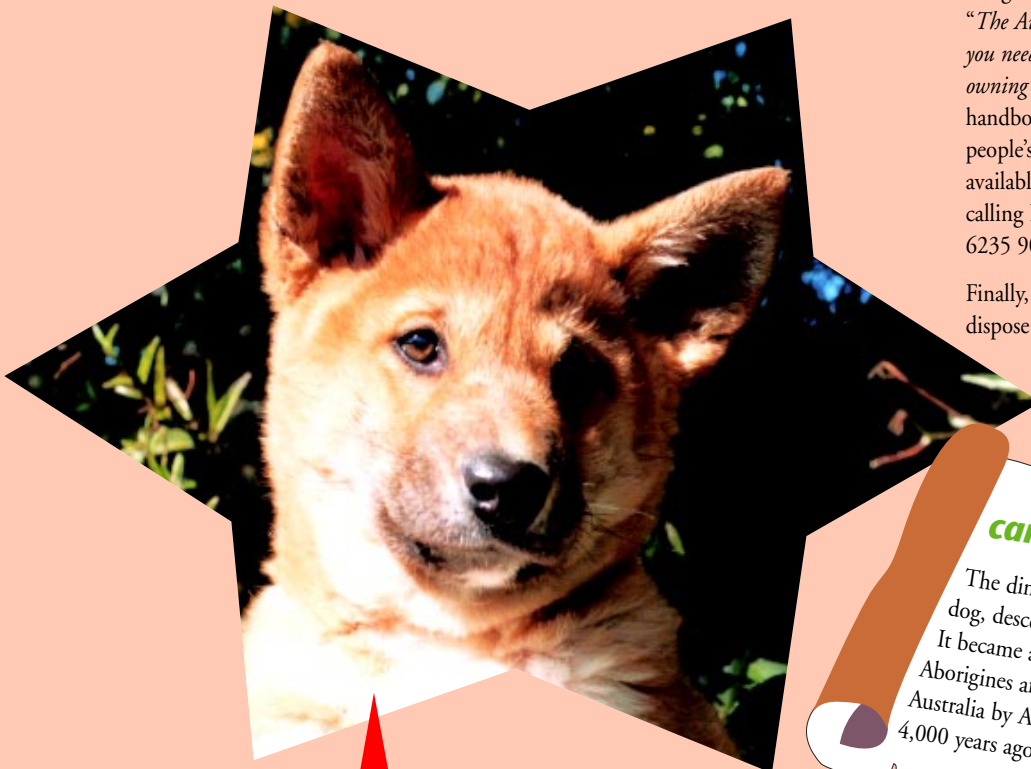
South eastern Highland Dingo, seven weeks old.

Finally, don't forget your application to dispose of dingoes which must be submitted to the Registrar for approval, prior to the transfer.