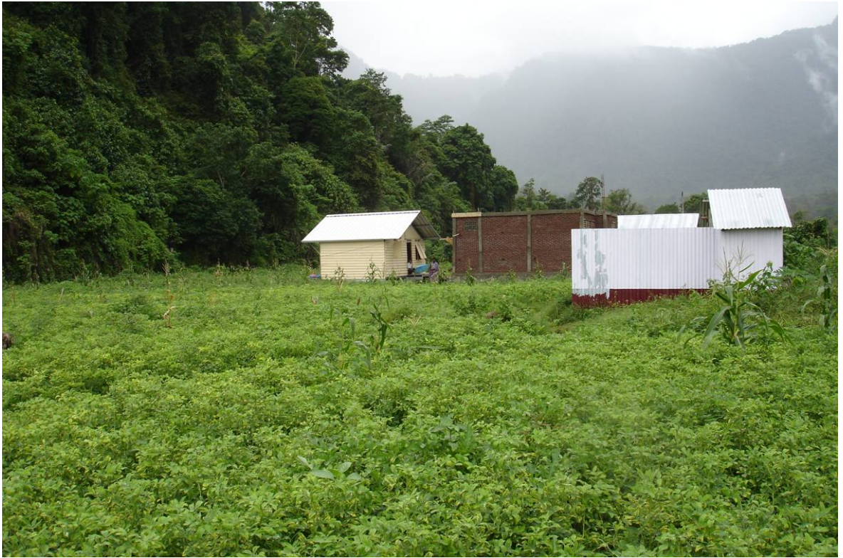
Figure 16: Poor weed control significantly reduced yields in this peanut crop