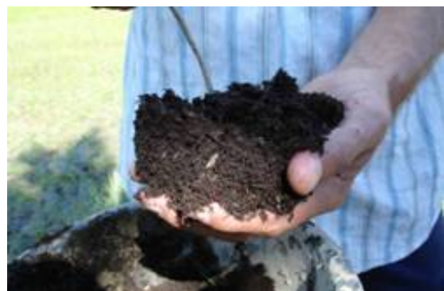
Figure 14: Compost is ideal for improving organic matter levels

Where possible, fertiliser recommendations need to include organic amendments such as manure or compost. Lack of organic matter in soils was identified as an important constraint to production in the tsunami affected soils in Aceh. The tsunami's scouring action removed organic matter, leading to a drop in soil fertility.