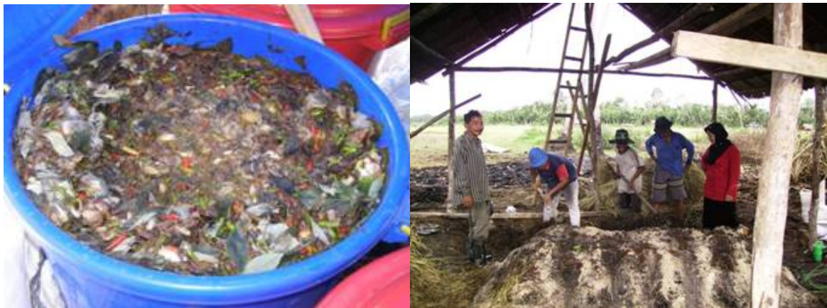
Figure 15: Liquid fertiliser from fermented organic products (left) and compost making (right)

Demonstration trials may be useful to compare crop production from fermented fertilisers, chemical fertilisers, and no fertilisers, or a 50-50 mix of chemical and fermented products.