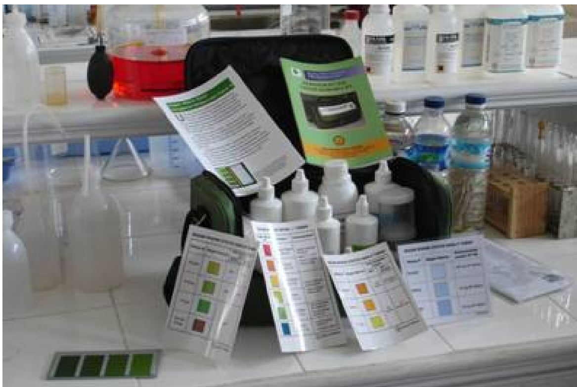
Figure 12: Contents of the paddy soil test kit produced by ISRI. Kits are also available for other crops like vegetables and sugar cane.

affected sandy soils. These problems meant that pre-tsunami fertiliser recommendations were often irrelevant, even wrong, so it is important to test tsunami-affected soils for at least the major nutrients before preparing the soil, fertilising or planting. Testing the soil will also ensure that the correct amount of fertiliser is applied; over-fertilising is a waste of money because nutrients not used by the plants leach out of the crop root zone.