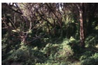
Bridal creeper smothering bushland.