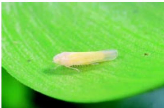
Figure 10. The bridal creeper leafhopper.

Biological control: The first biological control agent for bridal creeper, a leaf hopper, was released in 1999. Although it is too early to determine the effects of the leaf hopper (Figure 10) and the rust, scientists are confident that they will contribute to sustained control of bridal creeper infestations, particularly in combination with other treatments. A rust fungus ( Puccinia myrsiphylli ), was released in 2000 (Figure 11). Two other insects are still under investigation.