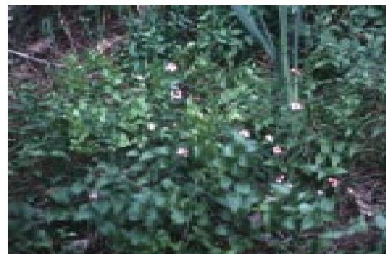
Figure 5. Pimelea spicata being smothered by A. asparagoides .

Species and ecosystems at risk: Bridal creeper is very competitive. Its shoots form a dense canopy which shades indigenous shrubs, herbs and seedlings. The tuber mat forms a thick barrier just below the soil surface which limits the access of other plants to soil moisture and nutrients. This barrier makes it difficult for seedlings of indigenous plants to establish. Bridal creeper will reduce the number and density of indigenous plants, in turn affecting animals which depend on these plants. Some rare species, such as orchids and Pimelea spicata (Figure 5), are threatened with extinction because of competition from bridal creeper.