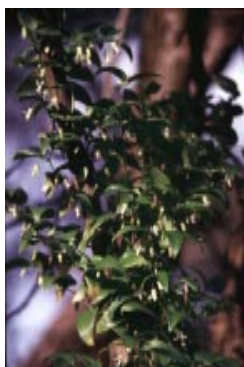
Bridal creeper foliage and flowers.