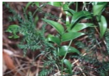
Figure 1. Foliage of Asparagus scandens (left) and A. asparagoides (right).

government weed agencies or on the web at www.weeds.org.au