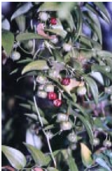
Figure 3. Fruit of A. asparagoides , note green fruit ripening to burgundy.