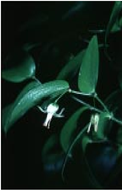
Figure 2. Flower of A. asparagoides .

(Figure 3). Pea-sized berries contain 1-9 seeds that are black when mature. With berry ripening, leaves yellow and fall, and stems begin to dry out and die back.