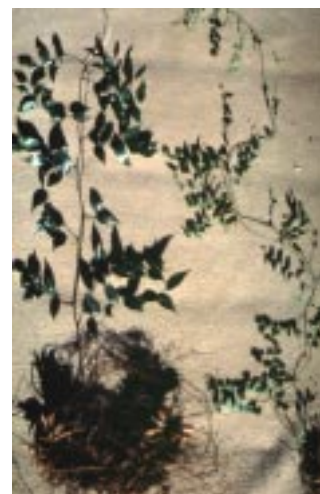
Figure 7. Above and below ground parts of A. asparagoides , note large tuber mat.

Growth calendar: In winter rainfall areas, seasonal stem growth from the tuber mat begins in March, with the first flowers appearing in August-September. By early November, green berries are beginning to ripen and turn red, whereas the leaves are beginning to yellow and fall. By early December, most shoots have died back. Heavy rainfalls in summer may modify the timing of these growth characteristics.