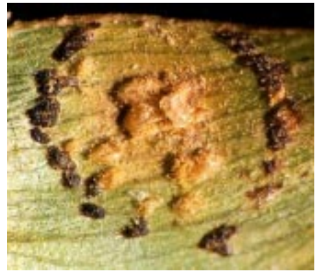
Figure 11. The rust fungus ( Puccinia myrsiphylli ) on a bridal creeper leaf.

Disposal: If the plant is being removed from gardens or natural ecosystems, dispose of it through local government kerbside collection or tip facilities. Care should be taken with disposal because of the ready ability of root material to spread infestations. Root material should ideally be dried before being bagged for disposal. Fruiting shoot material should be bagged immediately, to avoid being dropped or dispersed by birds. Cover trailers and ensure local tip facilities are following Australian standards for composting and transfer station or tip management best practice guidelines. Encourage gardeners to avoid dumping garden waste over back fences or in bushland areas. This plant material should not be incorporated into garden mulch material unless completely killed. Seeds should not be incorporated.