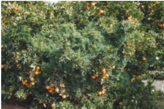
Figure 6. Bridal creeper smothering citrus orchard.

Economic impact: Bridal creeper can cause direct economic losses through smothering planted tree seedlings in forestry areas and in citrus orchards (Figure 6). It does not persist in pastures or most cropping situations due to grazing, cultivation and herbicides. In indigenous vegetation, the economic cost of a loss in biodiversity is immeasurable. Managers of conservation reserves, however, face considerable direct costs in managing infestations. Bridal creeper is time-consuming to treat. Herbicides must be used for effective control of dense infestations, an operation that must be done carefully to avoid damaging indigenous plants.