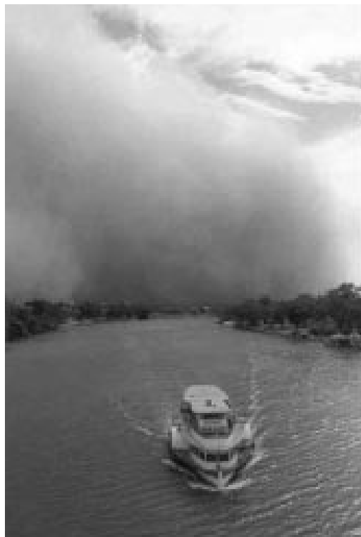
A dust storm chases the paddle steamer Rothbury along the Murray River at Buronga.

The interest in dust in the atmosphere stems from the realisation that very small