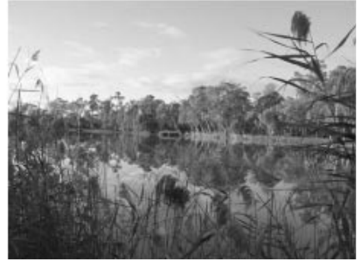
The Murray River – the backbone of the Barkindji Biosphere

The Biosphere concept has been portrayed as 'LandCare with grunt' as it incorporates not only the conservation aspects, but also the social and economic development, research, education and commercial ventures – with international networks provided by the UNESCO Man and the Biosphere program. Similar to the LandCare concept, Biospheres are flexible in their boundary with participation or otherwise within the programs being completely voluntary.