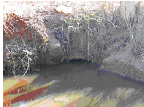
Heavily silted pipe culvert, downstream view.