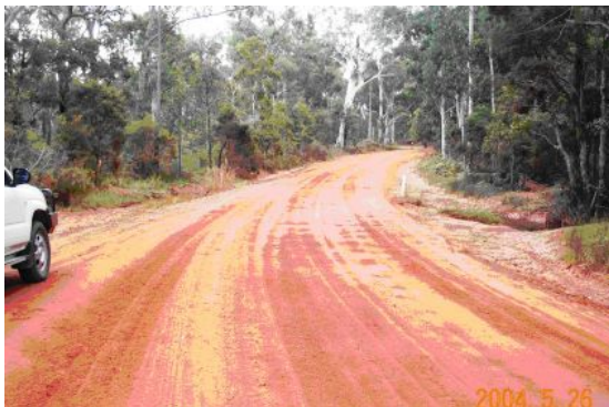
Unsealed Kungala Road at waterway crossing site.

[An extract from: NSW DPI (2006) Reducing the impact of road crossing on aquatic habitat in coastal waterways – Northern Rivers, NSW , Report to the New South Wales Environmental Trust, NSW DPI, Wollongbar, NSW]