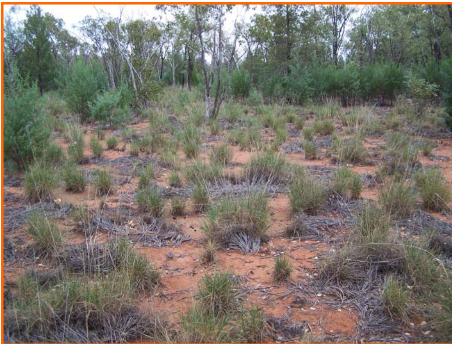
White Cypress Pine dominant area