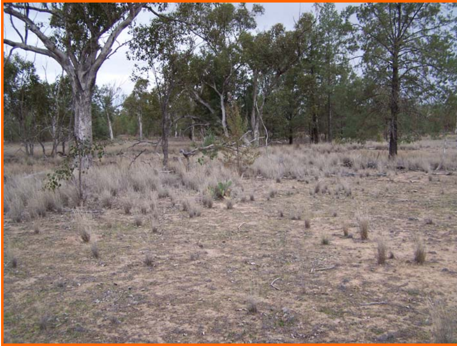
Area 3 'Barfield' Box Hollow