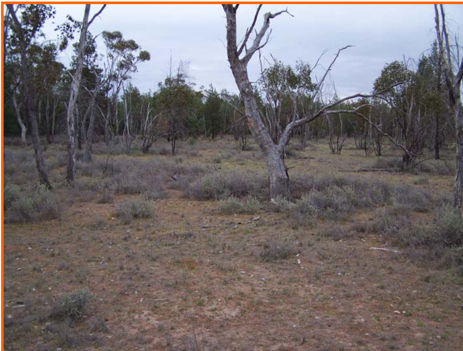
Area 4 'Barfield' Box Hollow