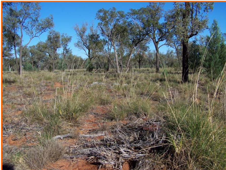
Area 1. Relatively undisturbed Cumborah Spinifex community