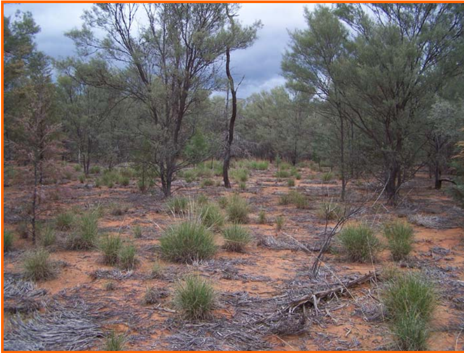
Mulga dominant area