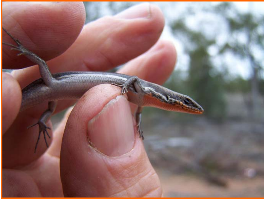
Boulenger's Morethia - Morethia boulengeri