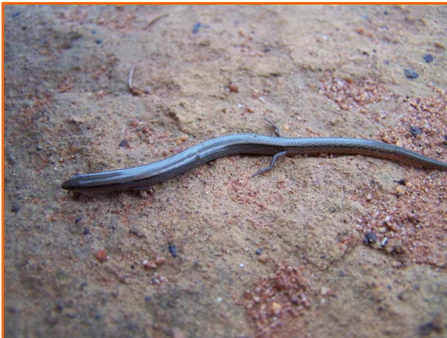
Three-toed Lerista - Lerista muelleri