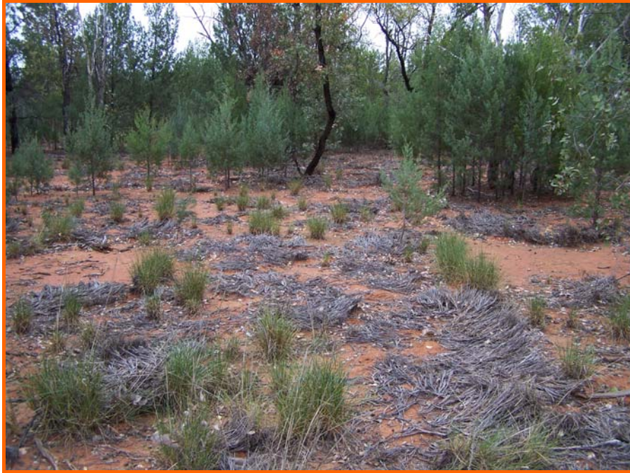
Spinifex community Area 2