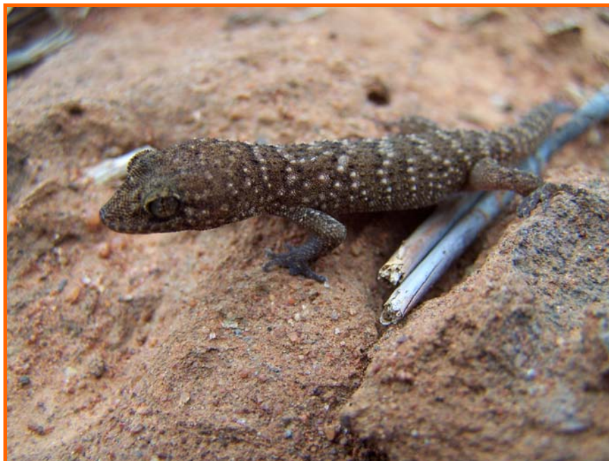
Prickly Gecko - Heteronotia binoei