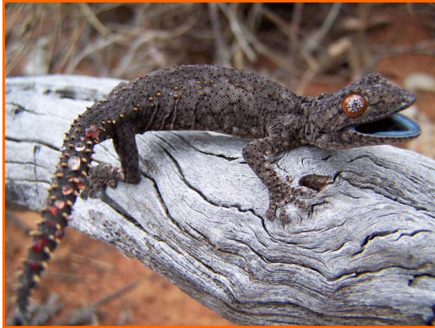
Eastern Spiny-tailed Gecko - Strophurus williamsi