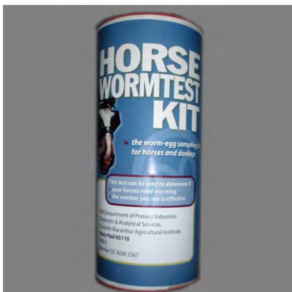
Figure 2. Horse Wormtest kits are available from Elizabeth Macarthur Agricultural Institute.

Wormtest results should be interpreted by considering such factors as the age of the horse, clinical signs, seasonal conditions, intended pasture use, stocking rate and management practices. The horse Wormtest kit detects the presence of egg-laying adult worms in the horse. It cannot detect larvae and immature stages of worms, which can cause significant disease. For this reason you should consult your veterinarian for an interpretation of Wormtest results. Horse Wormtest kits are available from Industry & Investment NSW Diagnostic and Analytical Services, at Elizabeth Macarthur Agricultural Institute. Phone 1800 675 623.