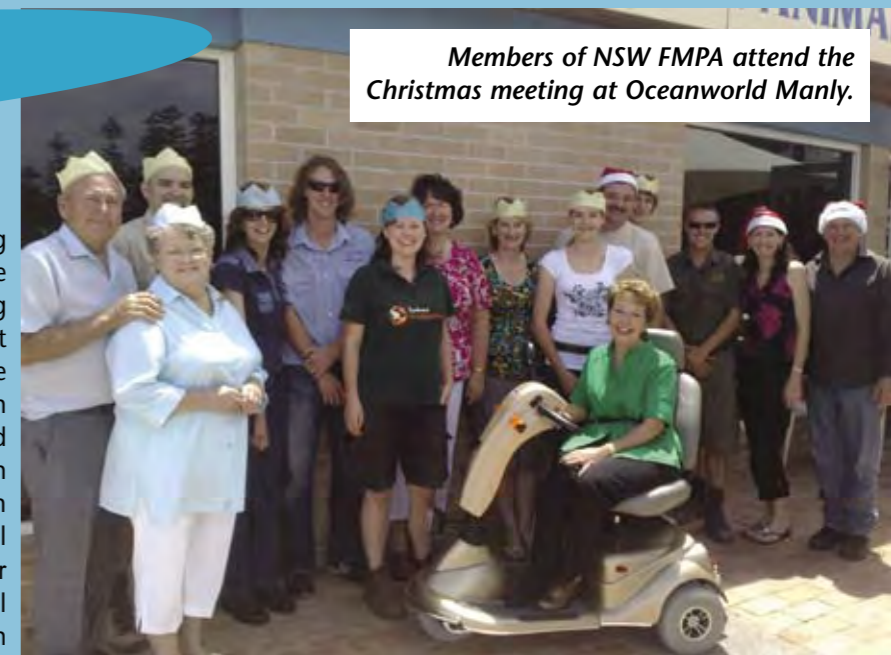
Members of NSW FMPA attend the Christmas meeting at Oceanworld Manly.