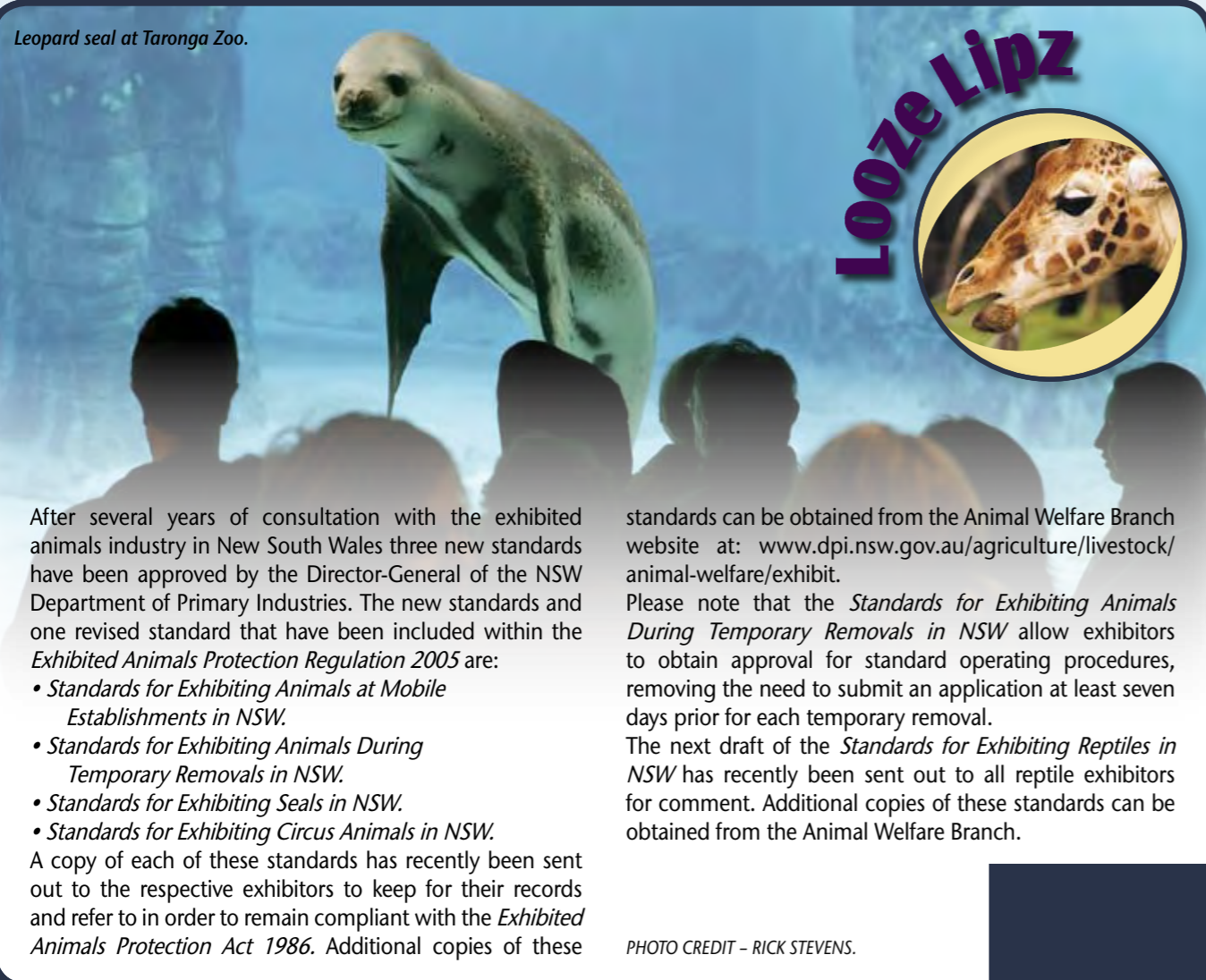
Leopard seal at Taronga Zoo.