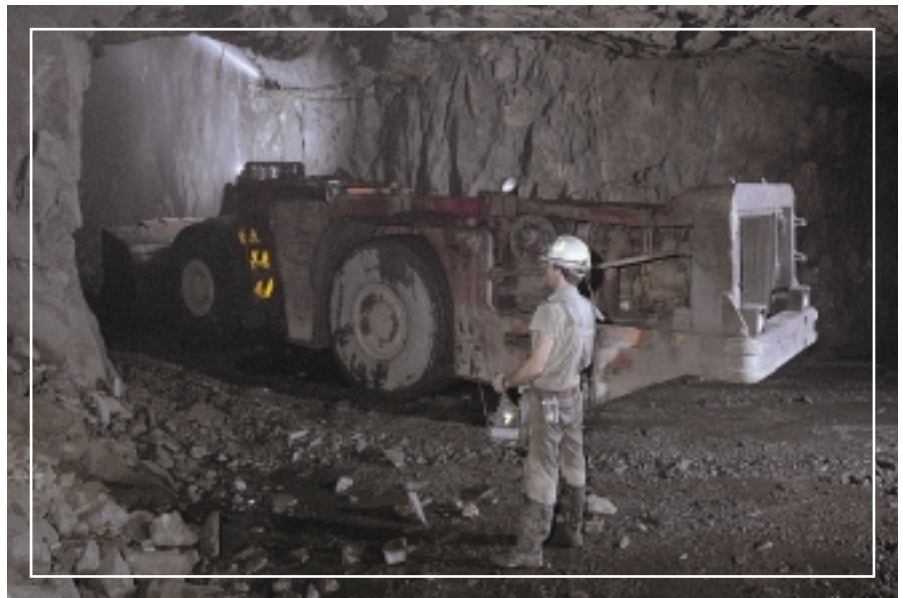
The study offers significant opportunities to broaden our knowledge of the possible causes of risk taking behaviour.