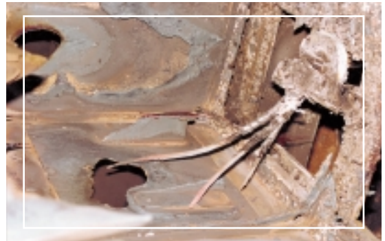
An 11,000 volt switch room destroyed by fire due to a short circuit.

Electrical circuits can fail in a number of ways. The most common failures are due to earth faults and short circuits. It is possible