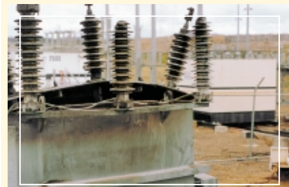
66/11KV, 5MVA transformer exploded due to a short circuit.

The study was conducted in two parts. Firstly, a survey was undertaken to gain feedback from the mining industry and to tap into the body of experience of the users. The second part involved a series of electrical tests that challenged the findings of the survey in an environment that would shed light on the most important aspects of the connector's design, assembly and use.