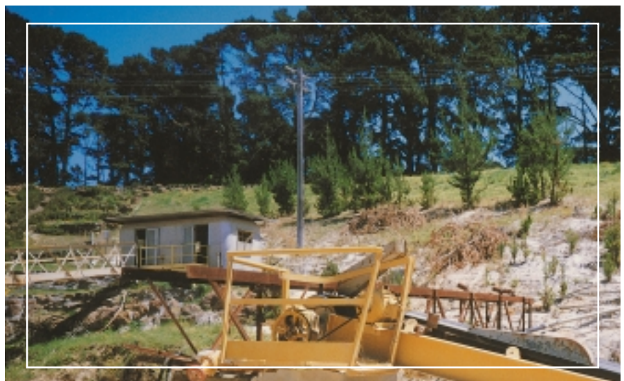
The unguarded head drum and pulley of the conveyor involved in the mine site fatality (Photo courtesy of Bob Johnson, Mine Safety and Environment, Broken Hill).

The NSW Government implemented an enforcement policy on 1 January 1999. A copy of the policy ‘The Enforcement of Health and Safety Standards in Mines’ can be downloaded from the Safety page on the Department’s web site at www.minerals.nsw.gov.au . ■■