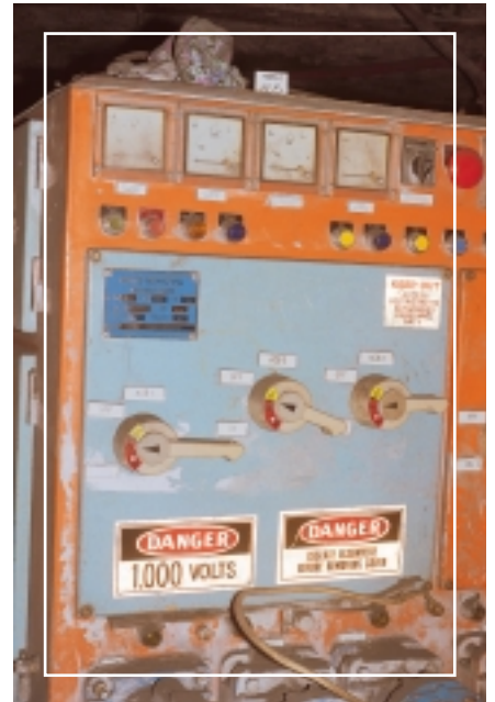
An increase in power requirements at mine sites means an increase in energy available.