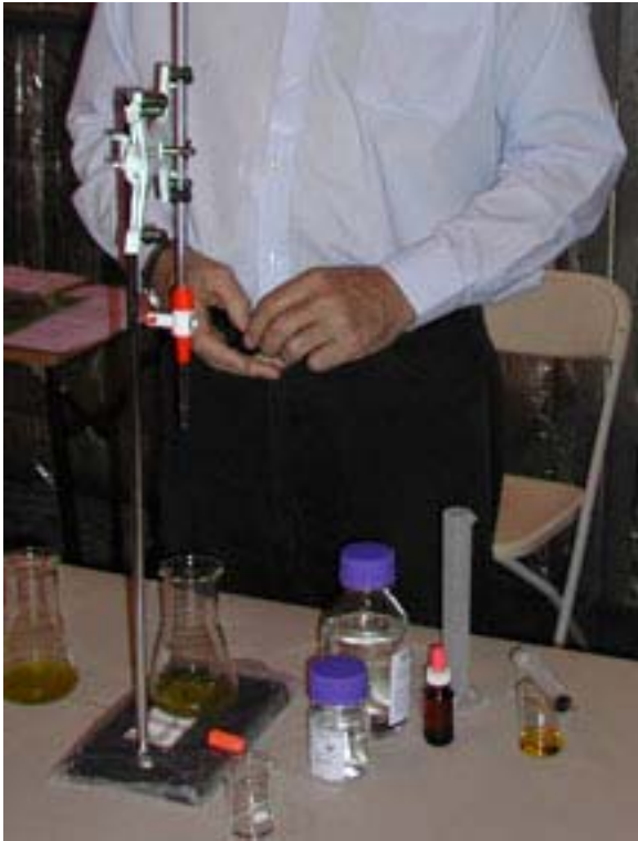
Figure 2. Test kit for home testing of free fatty acid content (available from Wagga Wagga Agricultural Institute).

In samples analysed by NSW DPI during 2005, the average FFA was 0.2%, indicating that most Australian producers have no trouble meeting the IOC standard of \leq 0.8\% for extra virgin olive oil. If the FFA is high, e.g. over 0.8%, it indicates that there has been fruit damage (frost, bruising), delays between harvest and processing or harvesting of over-ripe fruit. High FFA oils can be blended with low FFA oil to bring the FFA under a desired level. If FFA is high, there are likely to be other problems with the oil and blending may not be advisable. This may be the case if the fruit is frost damaged, as the oil will have a characteristic flavour as well as high FFA.