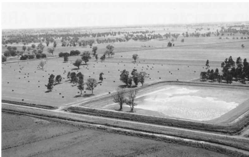
Figure 5: A farm storage built as part of a reuse system allows drainage water to be recycled for later use.

Design the on-farm drainage recycling system to allow access to the district drainage scheme, if available. During heavy rainfall, runoff from landformed country occurs very quickly. If the on-farm system can't handle the water then district drainage can be used to dispose of the excess water, if more than 12.5mm of rain has fallen in that rainfall event.