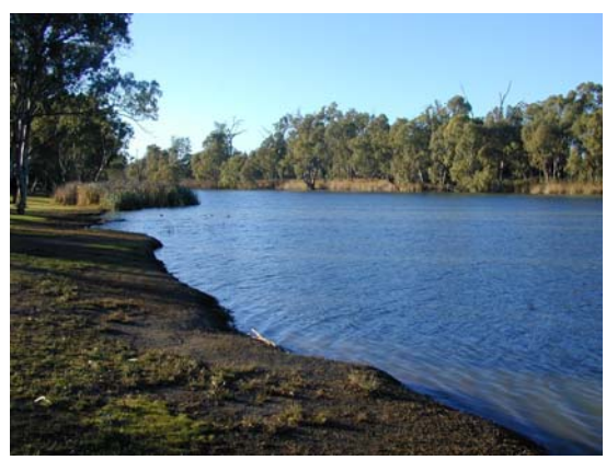
Darling/Murray River Junction, Wentworth.