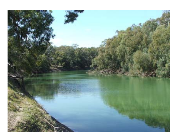
Darling River, upstream of Menindee.

The Darling River aquatic ecological community