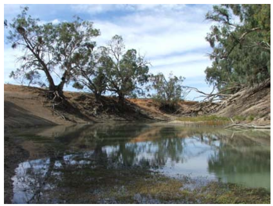
Darling River, upstream of Pooncarrie.