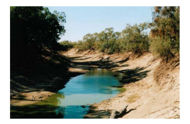
Darling River in drought, downstream of Wilcannia.

All existing bag, size and possession limits, closures and other fishing restrictions continue to apply.