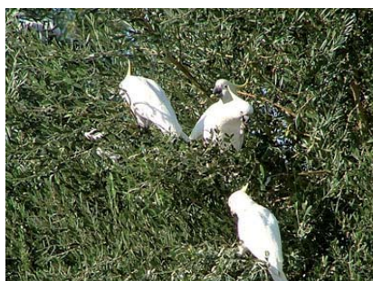
Remove fruit before it can be spread by birds and other animals.