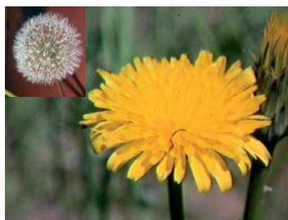
Remove spent flowers and mature weeds before seed can be dispersed by the wind.