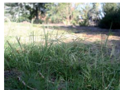
Mow weedy areas last and before weed seeds are produced. Clean mower thoroughly.

For further information visit the Weeds CRC's website: www.weeds.crc.org.au