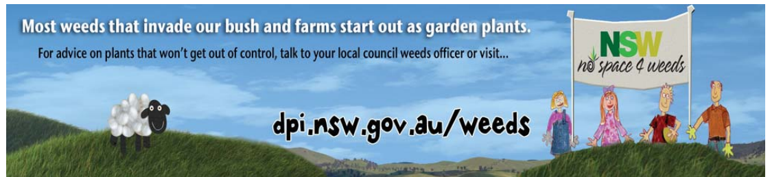
Figure 1. Slogan and theme for weed awareness activities in NSW for 2008-09

The first 'NSW – No Space 4 Weeds' display was held at the Mudgee Small Field Days in August 2008. A major display is planned for the Sydney Royal Easter Show this April. This display will utilise resources from the Nursery and Garden Industry NSW & ACT and the Sydney Regional Weeds Committees.