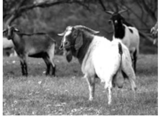
Above: Using a Boer billy over rangeland goats can result in the production of more kilograms of goat meat per hectare.

keenly sought after for the livestock export trade. This is because their higher growth rates than those of rangeland goats and the potential for hybrid vigour have allowed inventive producers to produce more kilograms of goatmeat per hectare, all other factors being equal.