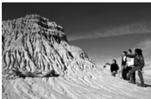
Above: Tanya Charles leads a Discovery Tour at the Walls of China, Mungo National Park.

As locals know, the Far West is looking fabulous at the moment, with rainfall over the last 12 months bringing a flurry of flowers and wildlife.