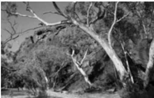
Above: Homestead Creek Gorge, Mutawintji National Park.