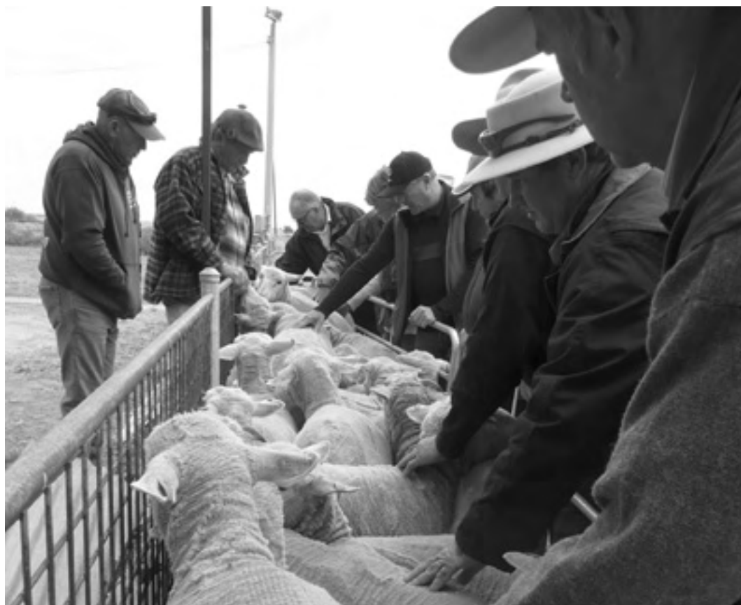
Above: Producers participating in the sheep fat scoring exercise at the Department of Primary Industries' Managing Scanned Ewes workshop held at the Mossgiel hall.