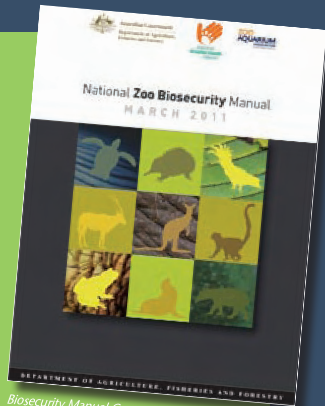
Biosecurity Manual Cover