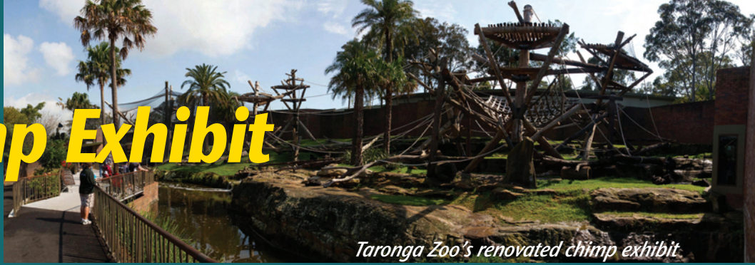
Taronga Zoo's renovated chimp exhibit.

The objective of the project was to provide a higher degree of exhibit complexity for the animals and to provide a second space that can temporarily house separate groups of chimpanzees while they assimilate into the main group. This functionality will support the zoo's ability to