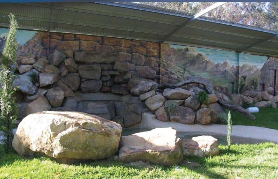
Snow Leopard Exhibit