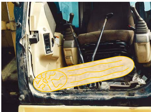
Direction of the pole

As the excavator slewed towards the truck, both poles dislodged. One pole fell to the ground, while the other speared into the operator's cabin.