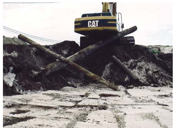
Poles final resting place

The pole lodged against the track controls, driving the machine forward. This resulted in the pole jamming across the operator's leg and into the access door. It was not able to be determined whether evasive action by the operator knocked the slew control or whether the end of the pole came into contact with the lever. Fortunately the cabin rotated to the left and the pole was released.