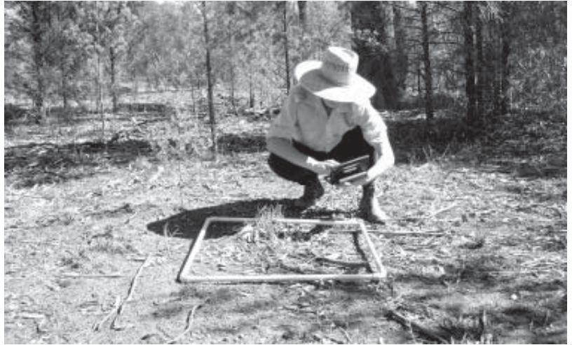
Assessing a Rangeland Assessment Program site

To provide feedback to landholders on these regional trends, DIPNR has produced a new brochure 'Rangeland change in the Hard Red Range-type'.