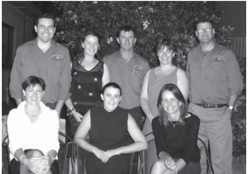
The 2002 YouthLink West Committee: