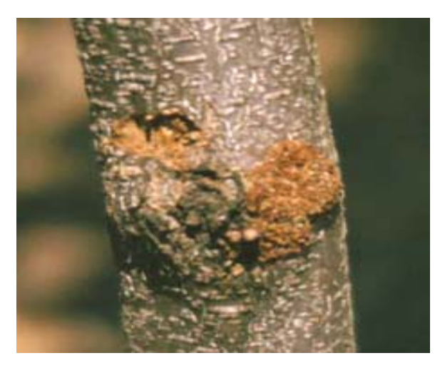
Figure 3. Evidence of borer in a tree trunk

The hazel aphid (Myzocallis coryli) can be a problem through the growing season and should be controlled when populations are high.