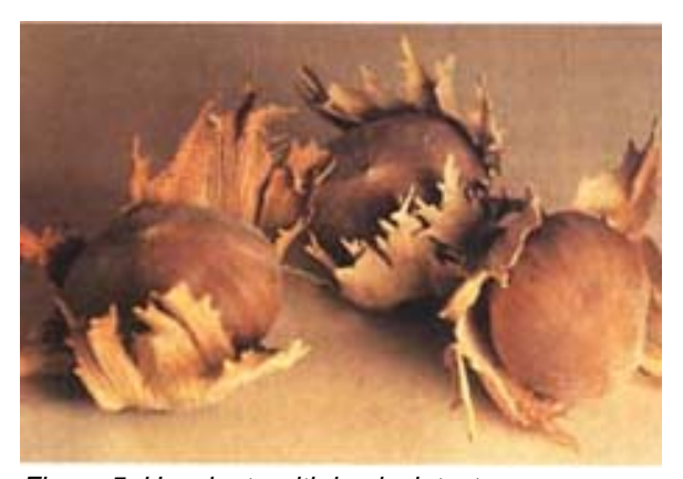
Figure 5. Hazelnuts with husks intact

In NSW hazelnuts start to fall in late February to early March; most have fallen by the end of March. Nuts are generally harvested with hand rakes, but if nuts can be windrowed with sweepers then suction equipment or self-propelled pick-up machines can improve the efficiency of the harvest. A mechanised harvester depends on the area under the trees being free from weeds, reasonably level, and firm. Currently in NSW no large mechanised harvesters are used for hazelnuts, and harvesting largely includes the use of smaller 'finger wheel' harvester units.