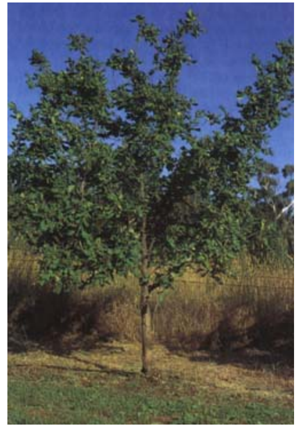
Figure 1. This 10 y.o. central leader hazelnut tree has a well-developed branch system.

Corylus is one of the six genera belonging to the birch family. The hazelnut (Corylus avellana L.) forms the basis for the more important commercial cultivars. The terms 'filbert' and 'hazelnut' are often used interchangeably to include all plants in the genus Corylus. C. maxima and C. colurna (Turkish hazel) also possess desirable characteristics.