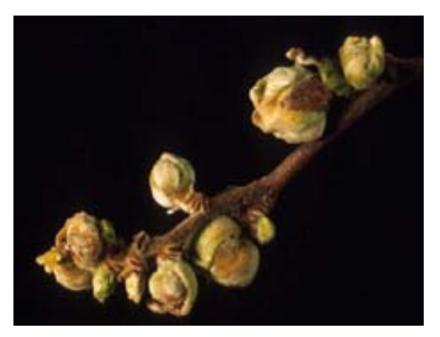
Figure 4. Buds infested with Big bud mite (Phytoptus avellanae) – buds are enlarged and desiccated.

A detailed pest and disease study from Australia is available from