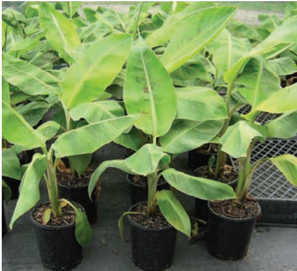
Tissue cultured plants almost ready for planting.

Panama and bunchy top diseases, nematodes, banana weevil borer and rust thrips can all be introduced to a plantation in contaminated planting material. Once they are introduced the viability of a plantation is decreased.