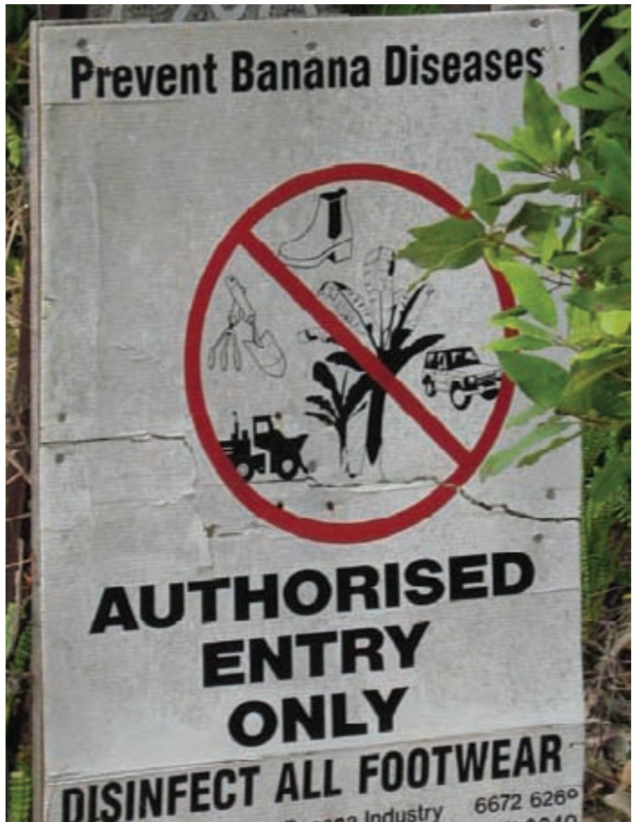
A quarantine sign at the entry to a banana farm.