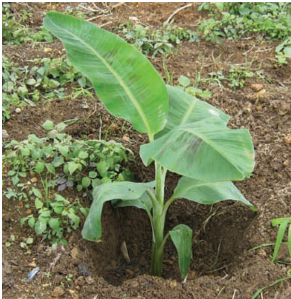
Tissue cultured plants are planted deep in the hole them backfilled.

Cull any suspicious looking plants. If you are uncertain and are not prepared to throw them out, then plant them at the end of a row so that any replacements will not be shaded out.