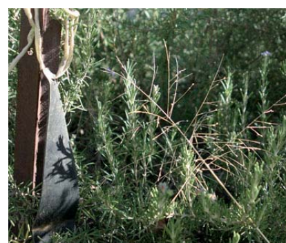
Many different types of plants use wind to disperse their seeds. These plants include (L-R) broadleaf weeds (eg flaxleaf fleabane); trees (eg Tree of heaven); and grasses (eg witch grass). Managing these weeds before they develop mature seed assists in preventing their spread to other areas.