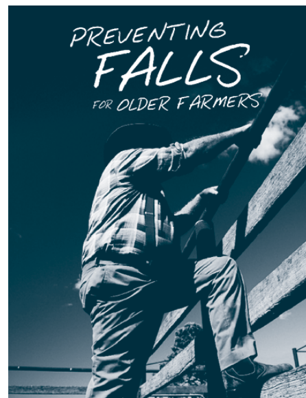
One of the resources produced by the Centre

For the past 20 plus years, staff from the Centre and Hunter New England Health have offered preliminary hearing screenings and promoted farm safety at field days such as AgQuip at Gunnedah.