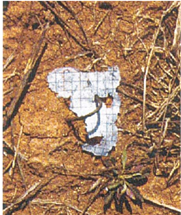
A monitoring card that has been chewed by mice. The amount of damage to this card is high. If the average on the other cards is similar, then the crop should be baited immediately.

Apart from simple monitoring techniques as described in the next section (like a walk through the crop, or placing sheets of galvanised iron or a hessian bag at strategic locations and noting population changes), snap-back traps and bait stations are useful guides to mouse abundance. In many research trials, live capture traps are placed