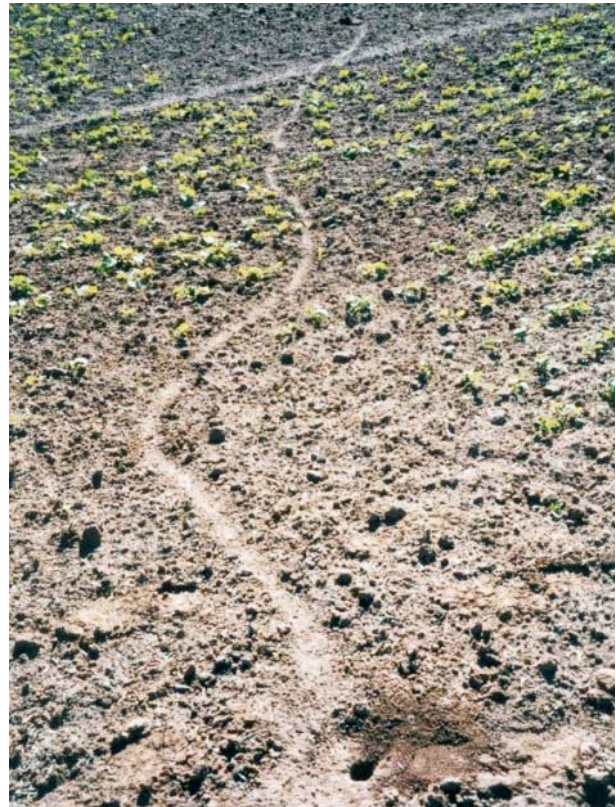
Tracks in a canola crop where the plants have suffered major and fatal damage in a circle accessible from the two well defined holes.

Another simple observation technique is to walk along a crop row or set path and collapse all mouse holes encountered over 100 m (or some other pre-determined distance). Then count all the re-openings each day for 2 or 3 days.