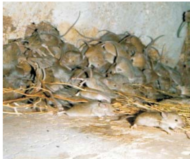
Under optimum conditions, one breeding pair of mice can produce 500 offspring in 21 weeks.

incisors into which the lower teeth fit. Native species have smooth, chisel edges. Also, native species have only four teats whereas the house mouse has at least one additional pair of thoracic or chest nipples.