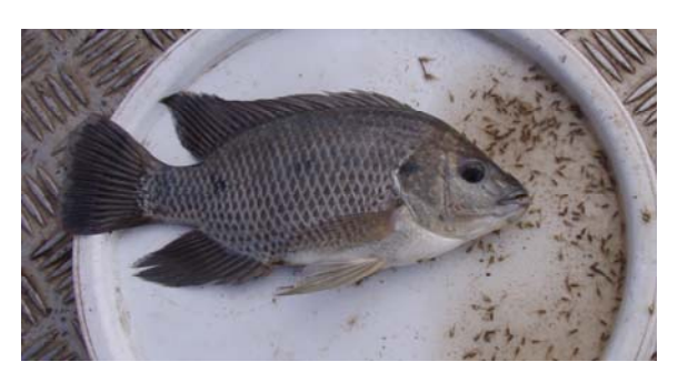
Mouth brooding female Mozambique tilapia.

Mozambique tilapia is a freshwater pest fish currently known to occur in southern Qld. Tilapia originate from southern Africa. They are very adaptable fish with a successful breeding strategy (mouth brooding) which make them a significant threat to NSW waterways. Tilapia has the potential to out-compete native species, disturb aquatic habitats and water quality and reduce the social, economic and environmental value of a waterway. Tilapia is dark silver to grey in colour and can be distinguished by their long continuous dorsal fin, which ends in a point. Please report suspected tilapia sightings to Aquatic Biosecurity NSW DPI 02 4916 3877