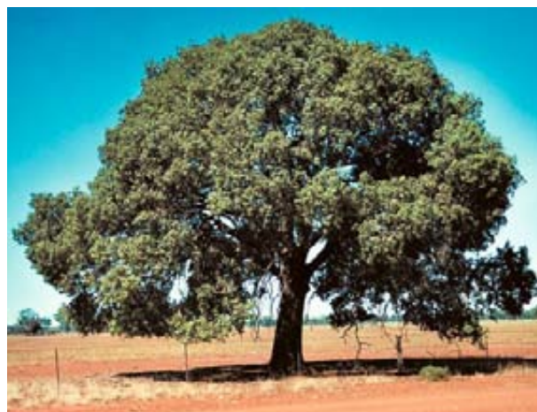
The kurrajong is useful for shade and is also an excellent fodder tree.

Trees may be lopped whenever forage is required. Once lopped it usually takes three to five years for kurrajongs to grow enough to be lopped again.