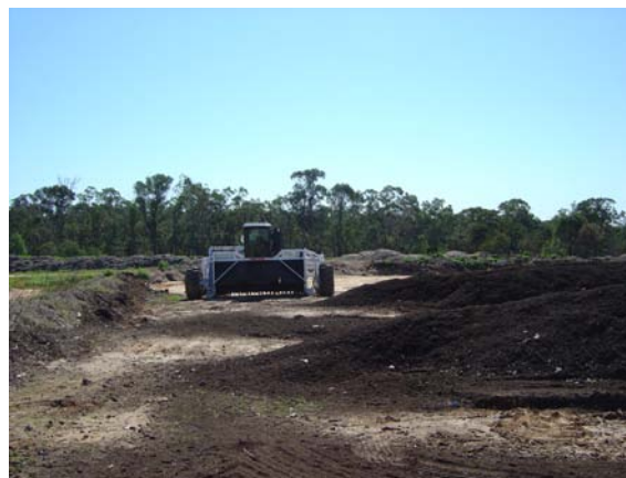
Figure 2. Straddle turner used to turn compost windrows.

Microbial activity will be reduced and temperatures will be lower on the surface of the windrow during the winter months. However, the composting process should not be overly affected by the time of year as the core temperature in the windrow should remain high.