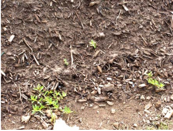
Figure 5. Monitor the windrows regularly for weeds growing in or around the compost. Remove any weeds found and review site processes and controls to prevent further outbreaks.