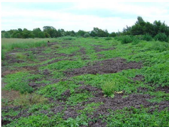
Figure 1. Once removed, salvinia and Egeria densa dry rapidly to form a loose and lightweight organic material, but alligator weed may continue to grow in the residual moisture.

Salvinia and Egeria densa rapidly decompose to form a loose and lightweight organic material (Figure 1) that is too light to compost well. To be dense enough for composting, it needs to be blended with other materials, such as leaves, grass clippings and woody prunings.