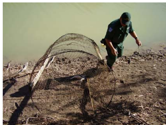
Illegal fishing activities are a threat to the EEC and should be reported to Fishers Watch on ph: 1800 043 536.