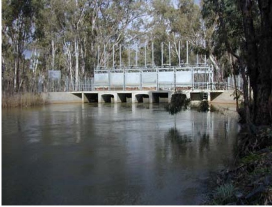
Edward River Regulator.