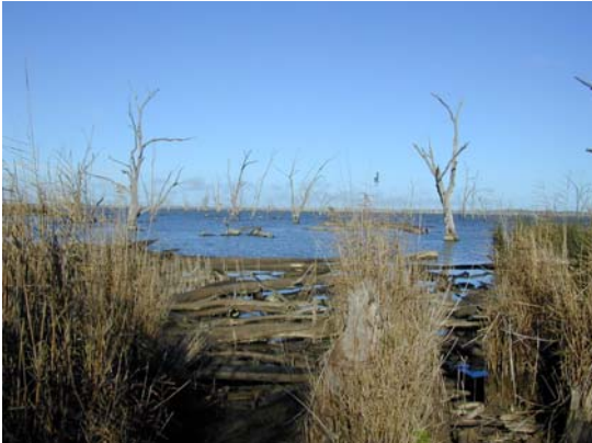
Lake Mulwala.