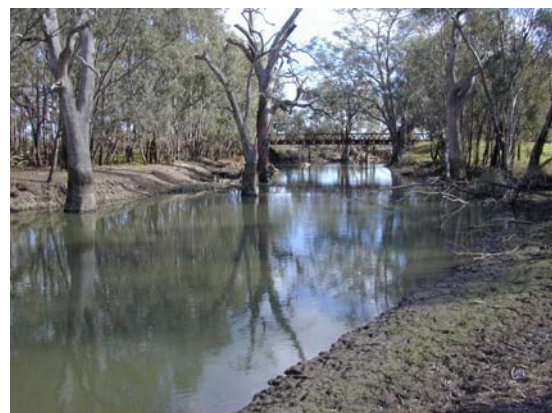
Yanco Creek.

The lower Murray ecological community occurs in a lowland riverine environment, characterised by meandering channels and wide floodplains. The land is generally flat to gently sloping.