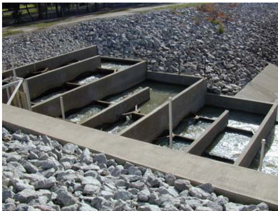
Fish ladder at Torrumbarry Weir.