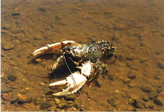
Murray crayfish – part of the EEC.