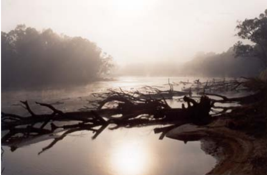
Large woody debris habitat.