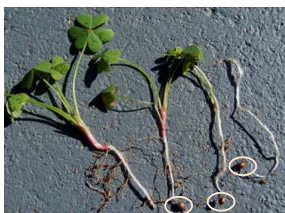
Oxalis can be difficult to eliminate from targeted areas as it produces numerous small bulblets (circled) in addition to larger bulbs.

Name: Oxalis pes-caprae , oxalis, soursob, Bermuda buttercup, yellow flowered oxalis, African wood sorrel.