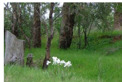
A bulb is a weed if it is growing in the wrong place and when it 'jumps' the garden fence.

An example garden weed planner for the bulby weed, oxalis, ( Oxalis pes-caprae ), is included as a case study in this factsheet. It illustrates a successful weed management plan using tactics from each Tactic Group and how to