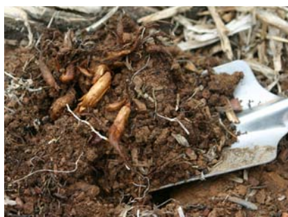
Oxalis bulbs can be removed from the soil by carefully digging them out with a trowel.

A blank garden weed planner can be found in the factsheet Managing garden weeds: planning tactics .