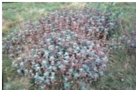
Figure 1. Horehound plants with burrs.

Habit/lifeform: Horehound is an erect perennial herb ( Figure 1 ), or spreading bushy aromatic perennial herb (and has a similar shape and form to lavender).