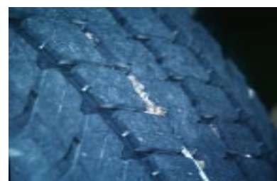
Figure 6. Horehound burrs are easily spread on vehicle tyres.

Once an infestation is established, prevention of spread into surrounding areas should be a priority. The area may be quarantined to stop movement of seeds and burrs on vehicles and equipment (both management and recreational) (Figure 6). Ensure stock are quarantined or clean of burrs prior to entry onto land. Managing rabbit and other pest animal populations will also help to reduce horehound spread. This may include the establishment of rabbit proof fencing around high priority land.