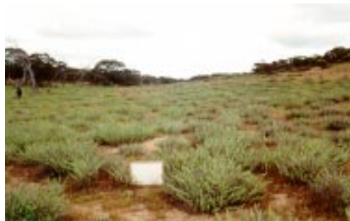
Figure 4. Infestation of horehound at Wyperfeld National Park, Vic.

Ecosystems invaded: Initially horehound occupies roadsides, channel banks, sheep camps, rabbit warrens etc., from which it encroaches into bushland and adjoining farmland. In natural ecosystems, it invades open bushland such as red gum, dry coastal vegetation, mallee shrubland (Figure 4), lowland grassy and grassy woodlands, black box woodlands, open grasslands and rocky outcrops especially if the areas have been disturbed, overgrazed or previously grazed by sheep. Horehound does not appear to be invasive in undisturbed native vegetation.