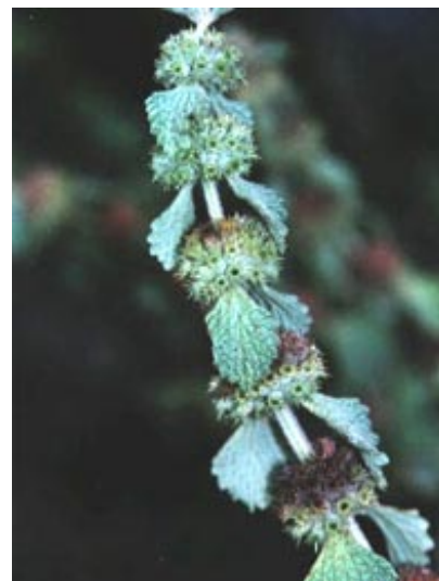
Figure 2. Horehound burrs are clustered around the leaf joins.

The plant is commonly 0.30 m high and 0.75 m wide but occasionally up to 0.6 m high and 0.9 m wide in favourable conditions. It is multi-stemmed with up to 200 individual stems.