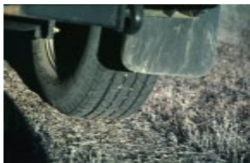
Horehound spreads on tyres.