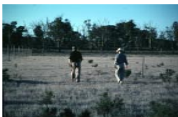
Community involvement.

The plant is commonly 0.30 m high and 0.75 m wide but occasionally up to 0.6 m high and 0.9 m wide in favourable conditions. It is multi-stemmed with up to 200 individual stems.