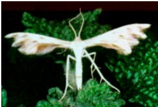
Figure 7. Horehound plume moth is a biocontrol agent for horehound well established in Australia.

Biological control: The horehound plume moth ( Figure 7 ), was first released in 1994 and is now established at over 100 localities throughout south eastern Australia (SA, Vic, Tas and NSW). This insect is specific to horehound; the caterpillars (larvae) feed on the growing tips of the plants and then work their way down the shoot, progressively defoliating the stem. This weakens the plant and reduces the number of seeds and flowers produced. It is essentially a cost-free technique after the initial establishment. Feeding by the larvae at a sufficient density will reduce the size and shorten the life of established plants. Once present for 4+ years at a particular location densities of at least one (in areas < 400 mm rainfall) or two (in areas with >400 mm rainfall) per shoot indicate plume moths are having or will have some impact on the infestation.