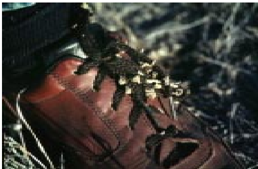
Figure 5. Horehound burrs readily attach to clothing, shoes and laces.

Health risks and other undesirable traits: Horehound leaves contain marrubin, a bitter alkaloid that makes them unpalatable to grazing animals. The meat of animals which are forced to eat horehound is tainted by the plant's strong flavour. About 7 grazing days on clean pasture are required to lose this. Horehound burrs are a nuisance to people by catching in clothing and socks (Figure 5), contaminating wool, and reducing fleece values.