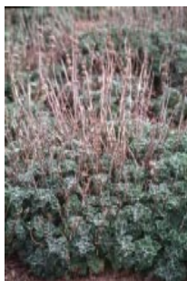
Horehound plant.