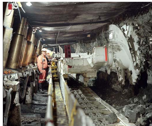
Figure 2: Longwall coal shearer and hydraulic roof shield supports.