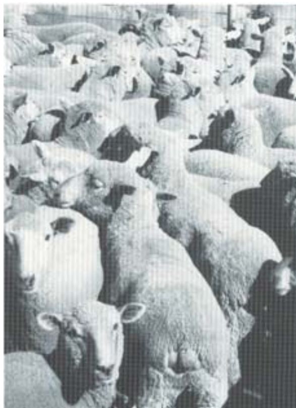
Mulesing attracts a premium.

Values will vary with presentation, assessed quality and age. Asking prices are usually at a premium for maiden ewes and from then on decline to prevailing mutton prices for ewes 6 or 7 years old.