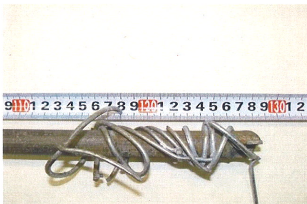
The drill steel, drill bit and entangled rib mesh

A miner suffered serious injuries to his left arm when it became entangled in steel rib mesh and a rotating drill steel. The miner's lower left forearm was later amputated while in hospital.