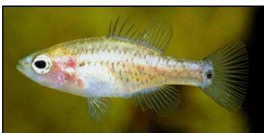
Oxleyan pygmy perch.

One of the outcomes of meeting best practice in Northern NSW is the protection of Oxleyan pygmy perch (OPP) ( Nannoperca oxleyana ) habitat. This small native endangered 1 fish is distributed patchily in the coastal floodplains of northern NSW and south-east Queensland.