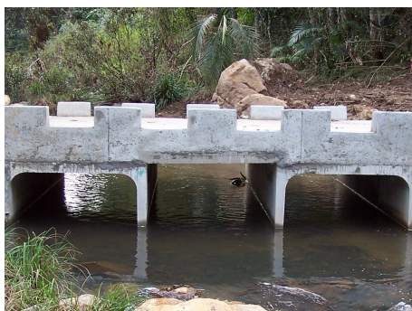
Crossings should always include a low-flow culvert to ensure adequate fish passage under all conditions.

Weirs and culverts can impede fish passage. Culverts should sit at or below bed level and should not funnel water into dark, fast moving streams.