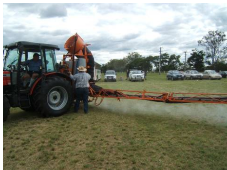
Demonstration of a Jacto sprayer

With the ability to measure and monitor nutrient levels in crops growers can take advantage of nutrient services available to implement improved practices for high quality crops. A presentation by Shaun Jackson, of South Pacific Seeds 'Vegetables are too cheap - A real perspective' highlighted the advances melon producers in overseas countries are implementing to meet market demands. His talk covered themes of commitment to high quality production, excellence in technical agronomic practices, innovation in production and marketing techniques and sensible business practices to remain relevant to markets.