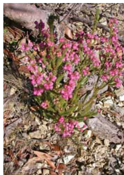
Berry heath ( Erica baccans): Tasmania.