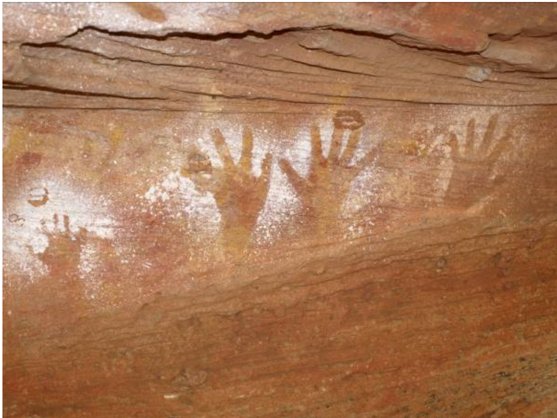
Mutawintji hand stencils.

Rock art includes paintings and drawings that generally occur in rock overhangs, caves and shelters. Stencils of hands, paintings or drawings of animal or people figures and animal tracks are common and have often been created using ochre, white pipeclay or charcoal. Engravings commonly occur on open, flat surfaces of rock such as on sandstone outcrops, although some occur in vertical rock faces and in rock shelters. Examples of engravings include outlines of people or animals, but may also include patterns, tracks and lines. Rock art is of high cultural significance to Aboriginal people, and many sites are still regarded as sacred, or of ceremonial significance. Rock art sites are important link to the past for Aboriginal people today. Rock art sites can also provide important information about the daily life and culture of Aboriginal people before European contact, and many sites are hundreds or thousands of years old. Rock art sites can be easily damaged as they can be prone to erosion and vandalism. Touching rock art or disturbing a shelter floor in the immediate vicinity of the rock art can cause damage, as can movement on or over surfaces with rock art. Sites may also suffer from vegetation growth or removal. Effective management of rock art sites can include drainage, fencing, graffiti removal, and visitor control.