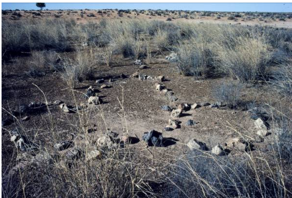
Stone Arrangement.

Management options around Aboriginal stone arrangements can include stock, weed and erosion control.