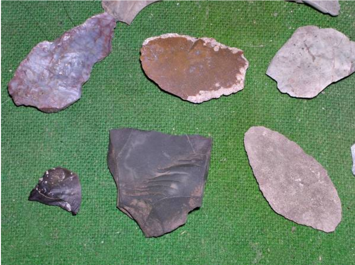
Stone Artefacts.

Stone artefacts are often small, so they can be difficult to protect. Erosion and weathering activities such as ditch digging and ploughing can disturb stone artefacts. They can also be broken when trampled by animals, or when run over by vehicles.