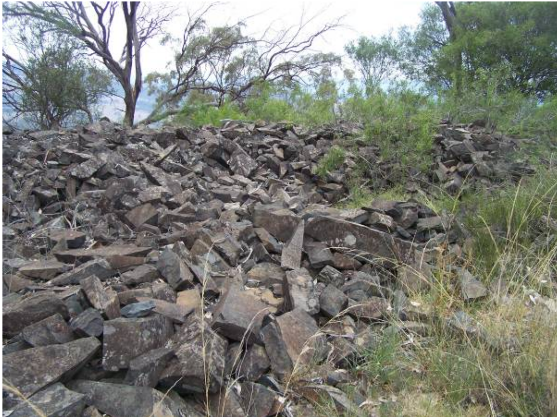
Daruka Axe Quarry Tamworth.

Aboriginal quarries can be protected by management actions such as by controlling stock and managing erosion.