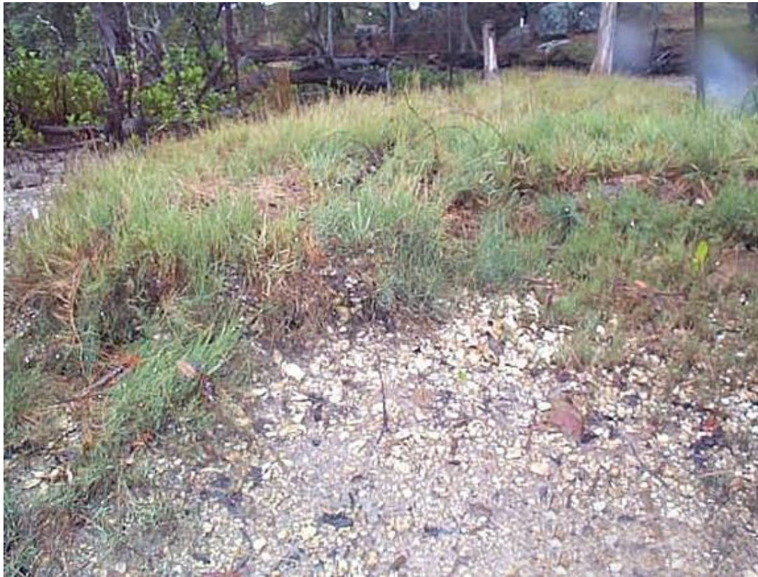
Shell Midden.

Middens are amongst the most fragile cultural sites. They can be exposed by wind or degraded by human and animal activity. Effective management of midden sites may include stabilising the surface, such as encouraging vegetation cover, or by restricting access to the site such as erecting fencing.