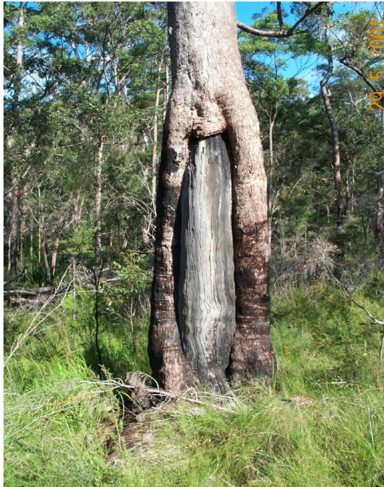
Carrington Scarred Tree.

It is important to note that the defence to a prosecution contained in Clause 80B of the National Parks and Wildlife Regulation 2010 relating to certain low impact activities does not apply in relation to any harm to an Aboriginal scarred tree. Ensuring that scarred trees are not harmed will likely include insuring effective buffer zones are used, as their significance is often part of the broader landscape.