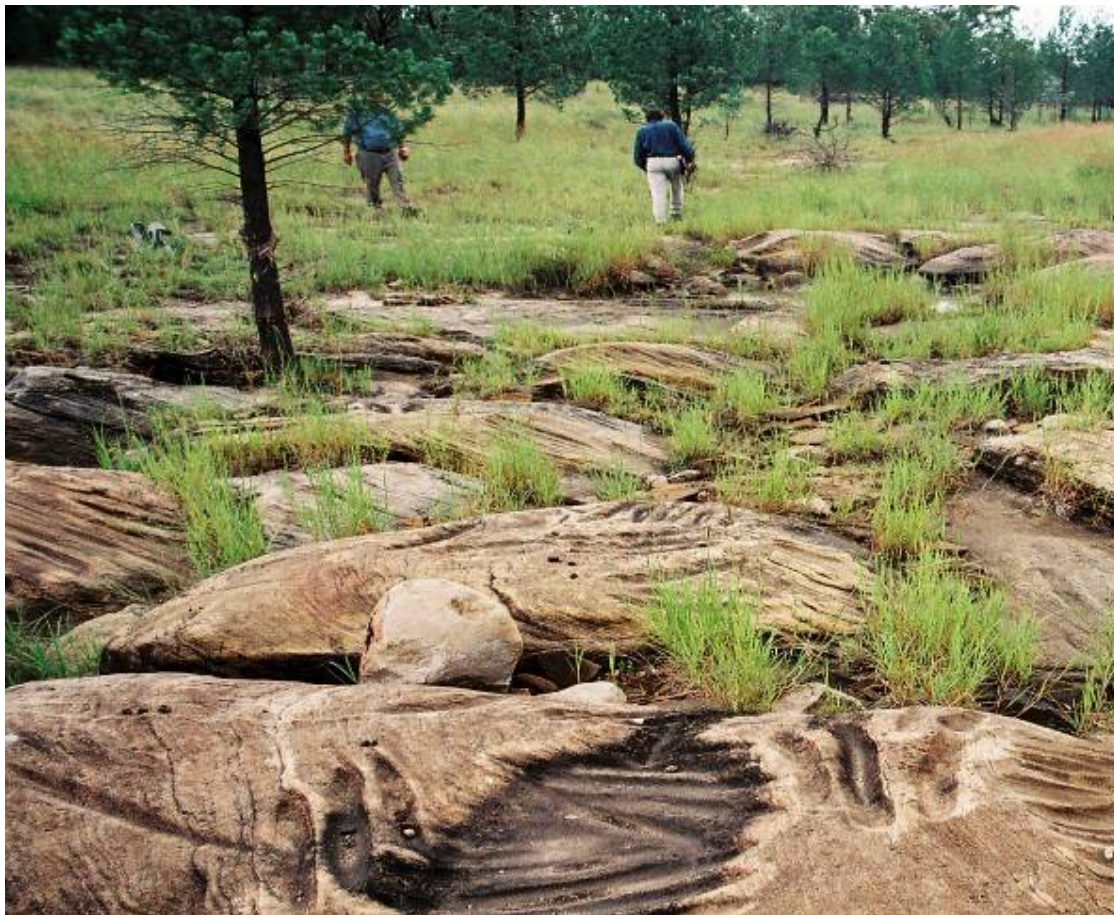
Axe Grinding Stones.

As sandstone is relatively soft, it is prone to weathering, erosion and trampling by animals. Human activities such as mining, road infrastructure, damming, clearing, ploughing and construction can also destroy these sites. Management options can include stock and erosion control.