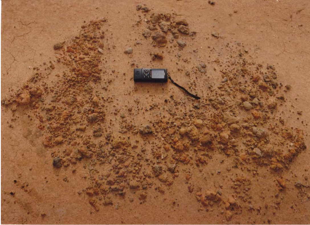
Hearth Sites

These hearths are roughly circular piles of burnt clay or heat fractured rock with associated charcoal fragments, burnt bone, shell and stone artefacts.