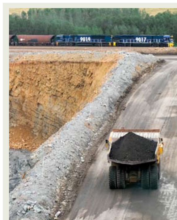
Risk management principles and consultation will form the basis for a new and more relevant legislative framework for the NSW coal mining industry.

The Regulation details further elements be included in the health and safety system and include an inspection program, information and communication arrangements, supervision arrangements, electrical engineering and mechanical engineering management plan,