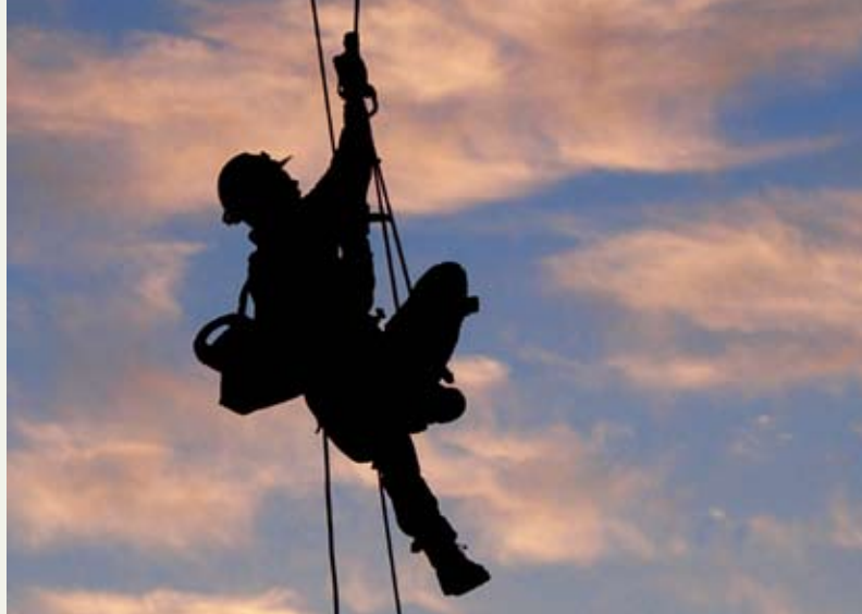
The Mines Rescue Challenge at Cobar attracted rescue teams from throughout NSW.