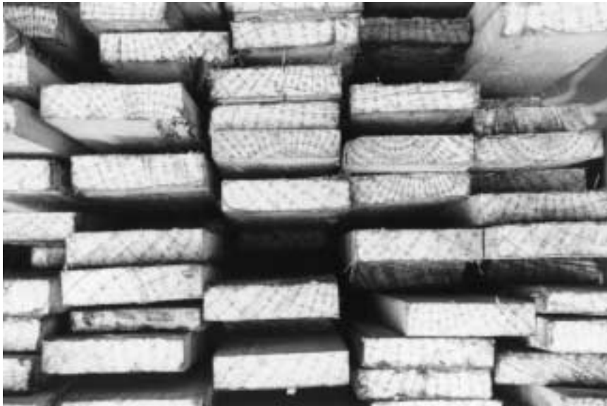
Figure 2. — Board ends after sawing with log template sections attached. Note some darkened templates from exposure to rain.

tacted these films, they were torn from the glued areas adjacent to the cut. This didn't occur with paper and fabric as these products were low strength. Permanent printing was also necessary and this proved more difficult with fabric. The fabric product could not be printed in normal commercial printers. Normal bond paper proved to be low strength so that a clean edge was achieved after cutting. The paper was successful in com-