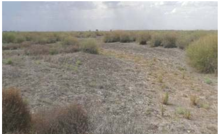
Above: Booligal Wetland during a dry phase.

Wetlands on Farms project officers work closely with landholders and the CMA to identify appropriate goals and actions to reduce the impacts on these wetlands. The CMA assists with incentive funding for onground works and training to increase skills. For more information contact I&I NSW in Dubbo on 02 6881 1284.