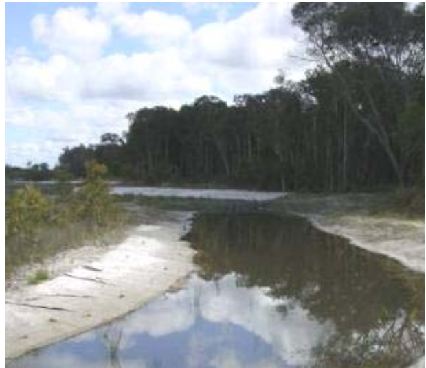
Is this a stormwater drain or threatened species habitat? It's both!

http://www.dpi.nsw.gov.au/_data/assets/pdf_file/0003/296076/stormwater-workshop.pdf