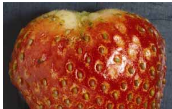
Figure 3. Surface russetting around seed caused by WFT.

Fruit damage includes surface russetting around seeds from late green to ripe fruit. The fruit can take on a seedy bronze-like appearance.