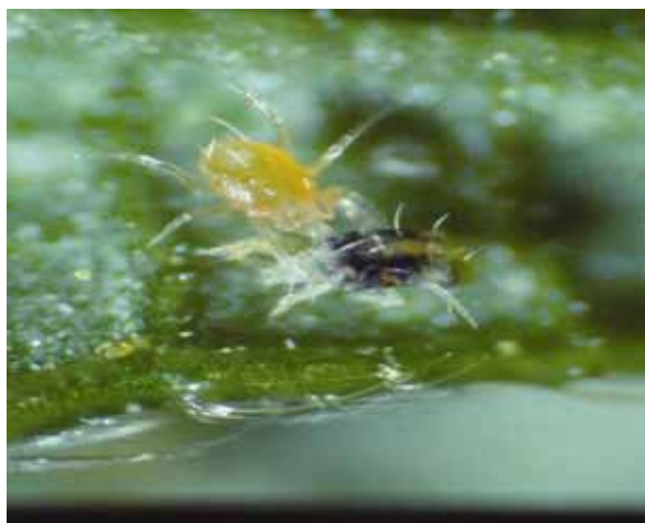
Figure 9. Phytoseiulus persimilis attacking two-spotted mite.