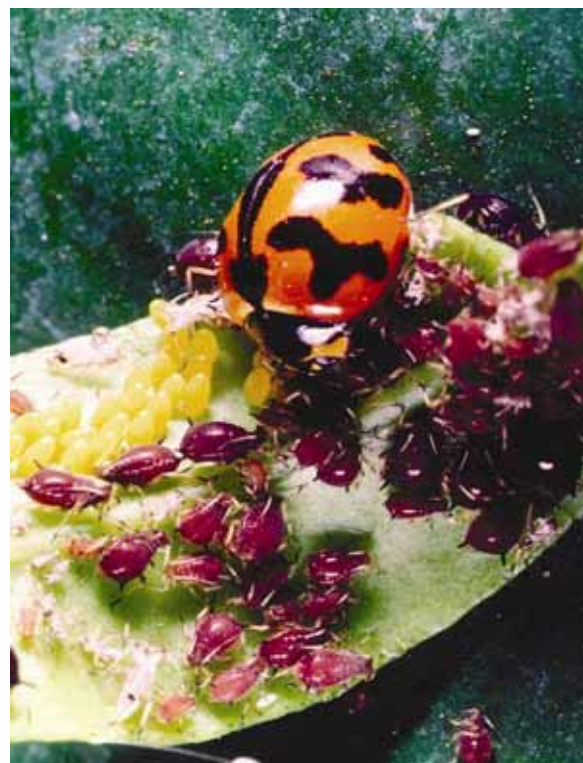
Figure 11. Ladybird beetle attacking aphids.

© State of New South Wales through Department of Industry and Investment (Industry & Investment NSW) 2009. You may copy, distribute and otherwise freely deal with this publication for any purpose, provided that you attribute Industry & Investment NSW as the owner.