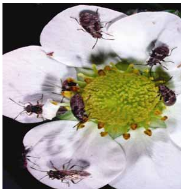
Figure 6. Rutherglen bug on strawberry flower.

Adults and nymphs can damage flowers, seeds and fruit. Large numbers of bugs in strawberry flowers during pollination can result in deformed fruit that remains small, dry and take on a 'cat face' appearance.