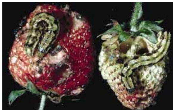
Figure 5. Corn earworm damaging fruit.

Infestation is mostly in spring and autumn and is more common in warmer growing areas.