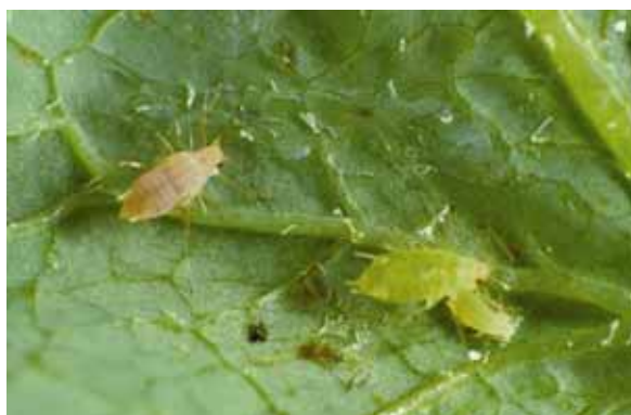
Figure 4. Green peach aphid.

Aphids are considered a minor pest but can infest strawberries at any time and rapidly build-up in numbers. Aphids are sap sucking insects found on the underside of leaves and around flower buds. Sooty mould, caused by honeydew excreted by aphids, can spoil fruit and make picking difficult.