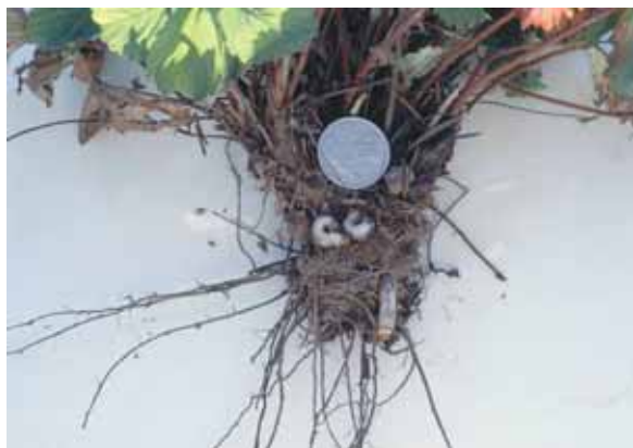
Figure 7. White curl grub feeding on roots.

White curl grub is considered a minor pest of strawberries. They can damage the plant by feeding on the root system. Plants affected by this insect can show early signs of wilting, remain small, weak, and both yield and fruit quality is affected. If large numbers of insects are present, plants may die.