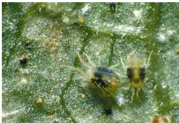
Figure 1. Two-spotted mites.

The first signs of damage are speckling and mottling on the surface of leaves. In heavy infestations, leaves turn purple, with white webbing between leaves.