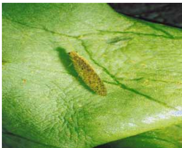
Figure 10. Lace wing.