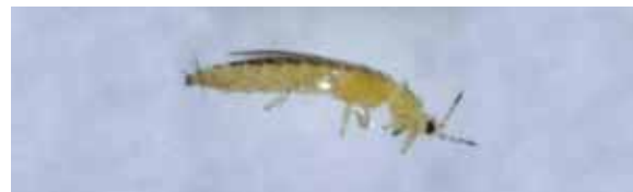
Figure 2. Western flower thrips (WFT).

Western flower thrips (WFT) are a major insect pest of strawberries. Both larvae and adults can damage strawberry flowers and fruit.