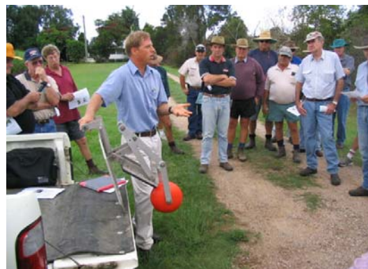
Working with communities was all part of the process of implementing on-ground works and gathering support for rehabilitation of aquatic habitat during the BBTF project.