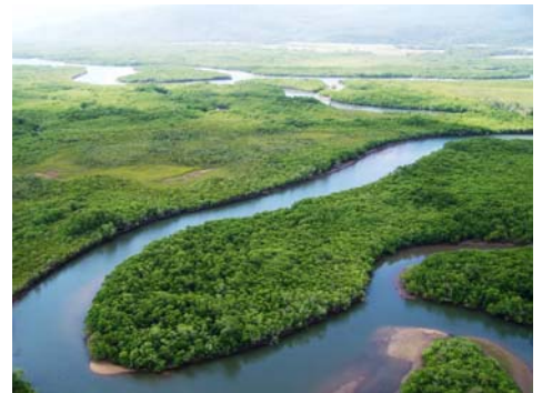
Trinity Inlet: declared Fish Habitat Area, north Queensland.

In 2009, the FHA Network celebrated its 40th anniversary, with the first areas declared in Moreton Bay near Brisbane in 1969. The network of 70 declared FHAs now protects 880,000 ha of high quality fish habitats. Declared FHAs help sustain commercial and recreational fishing sectors by protecting the habitats that sustain fish stocks while still allowing legal fishing. For more information or to get a copy of the strategy visit http://www.dpi.qld.gov.au/28_16051.htm or contact DEEDI on 13 25 23.