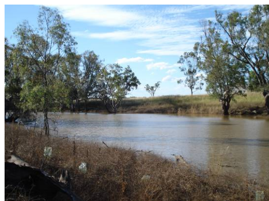
Cultural surveying workshops will be held along the Namoi demonstration reach, and may include priority sites such as Gulligal Lagoon (above).