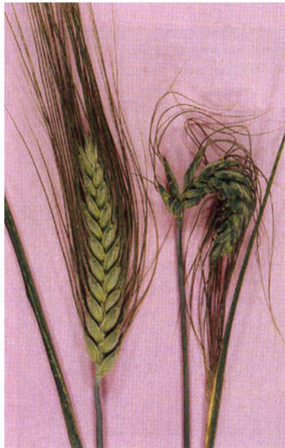
Wheat awns trapped by flag leaf damaged by Russian wheat aphid feeding.

Feeding on open leaves causes the leaf to roll inwards around the aphid providing a suitable and protected microclimate. Infested flag leaves that remain unrolled trap the awns which prevents the wheat head from fully emerging and reduces grain fill.