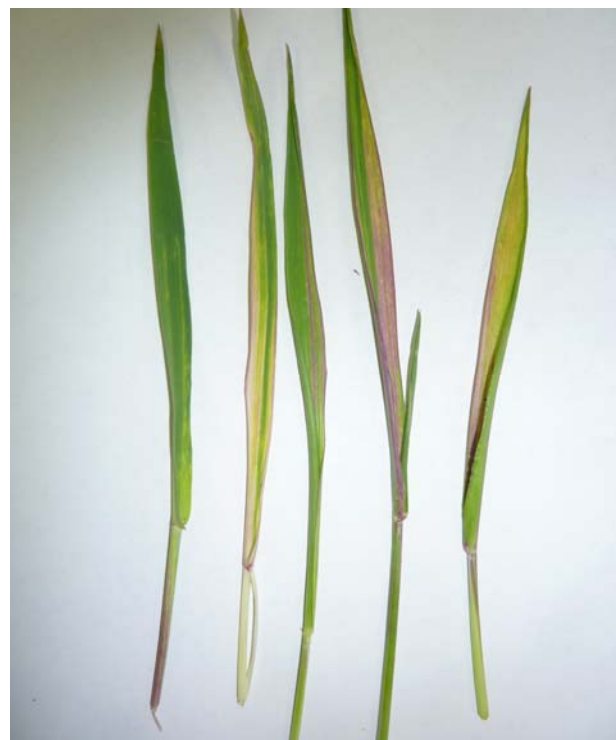
Leaf colour variation (left leaf) caused by Russian wheat aphid feeding (Photo: A. Nicholas, Oklahoma 2011).

Initially Russian wheat aphid feeding causes a small light brown blotch that can be confused with damage by other insects and more problematically with symptoms caused by disease.