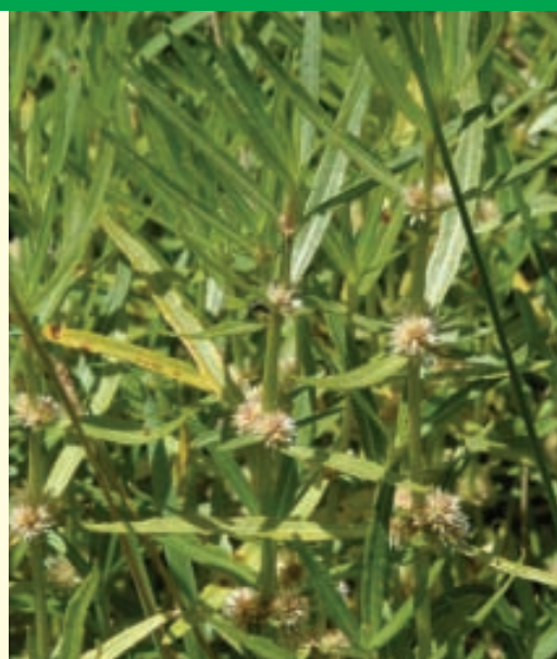
Alternanthera denticulata.