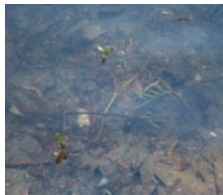
Stems can be rooted in the substrate in shallow water.