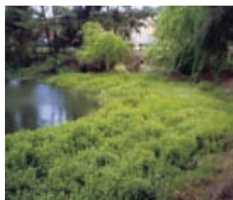
Banks and edges of waterways provide ideal habitat.