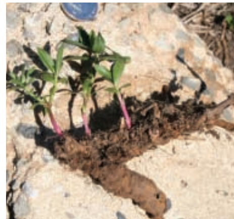
Root storage tissues allow survival over dry periods.