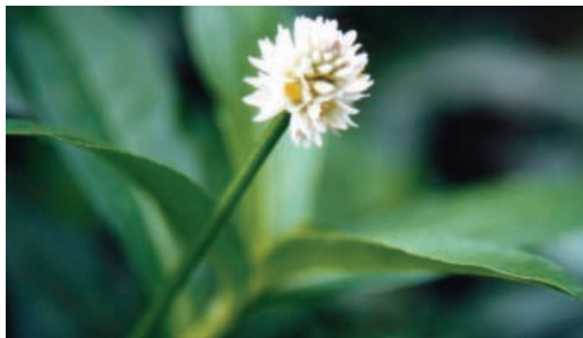
Papery, white, ball-like flowers on stalks.

Papery white ball-like flowers occur on peduncles (stalks) 1 to 9 cm long. Each ball-like flower is an inflorescence made up of a number of smaller individual flowers. Alligator weed flowers in mid to late summer, peaking in January in aquatic situations and earlier (from November to January) in terrestrial situations. Seed production has not been observed in Australia.