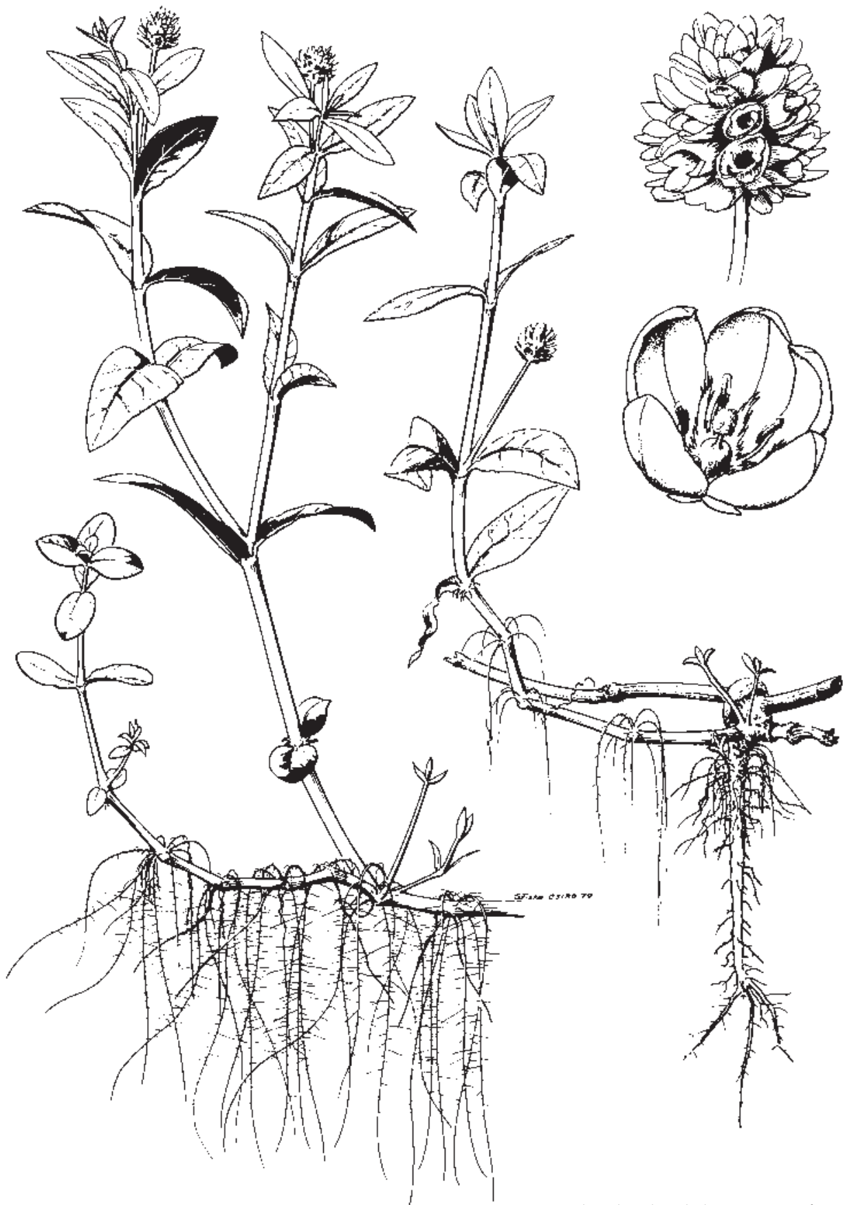
Line drawing by S. Fiske. Used with permission courtesy of CSIRO