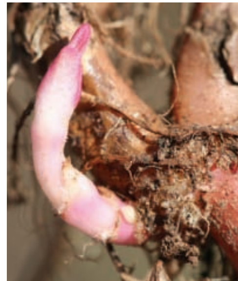
New stem growing from root material.