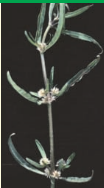
Alternanthera denticulata .