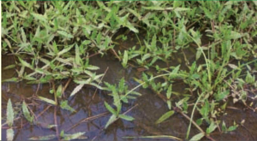
Enydra fluctuans .