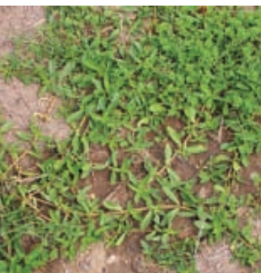
Prostrate winter growth.

Plant biomass on land is less than in water; however, terrestrial alligator weed has the ability to form very extensive root systems, with the below-ground biomass measured at 10 times that of the above ground biomass. Terrestrial root masses are up to seven times heavier than aquatic root masses (on land the tops to roots ratio is 0.3, whereas in water the ratio is 5.6) (Schooler S, Cook T, Prichard G, Bourne A, Julien M, Effects of selective and broad spectrum herbicides on below-ground biomass of alligator weed, submitted to Weeds Research ).