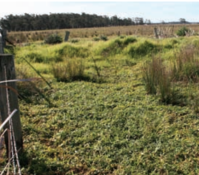
Alligator weed dominating wetter sections of pastures, with grasses predominating in slightly elevated areas.