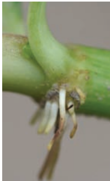
Roots occurring at stem node on a terrestrial plant.