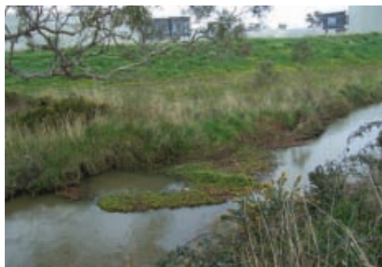
Mats can free-float and take root further downstream.