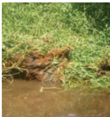
Mats of stems, roots and leaves growing rooted in the bank.