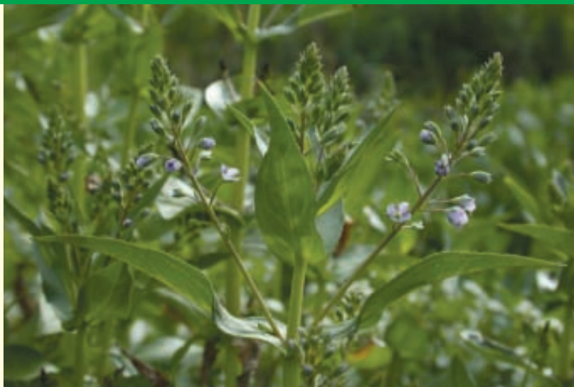
Blue water speedwell.