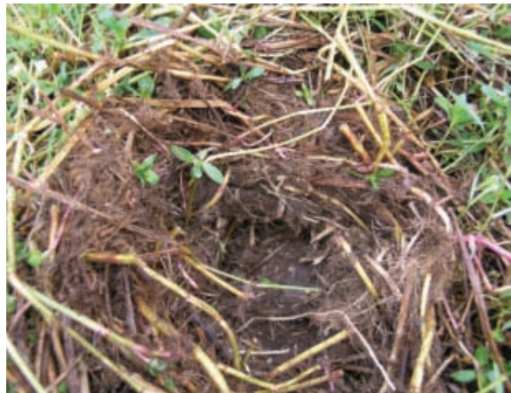
Dense mats of stems, stolons and roots form above and below the soil.