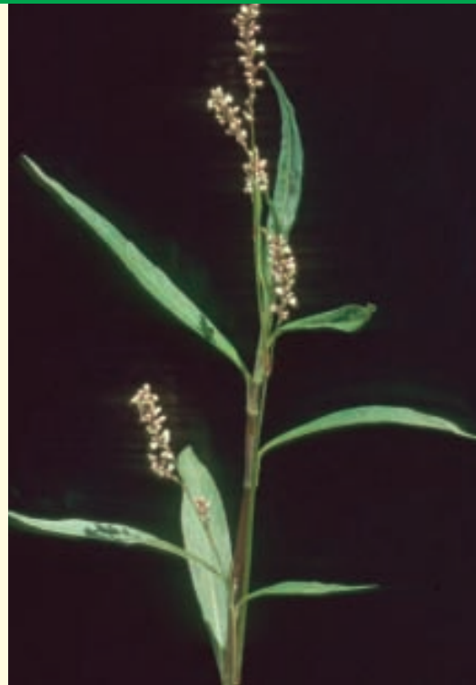
Smartweed . Photo: Bruce Auld