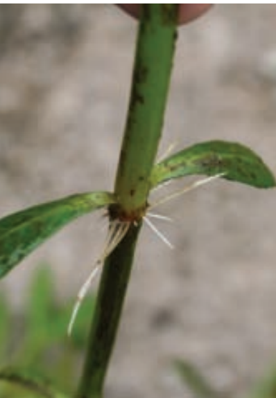
Roots occurring at a stem node on an aquatic plant.