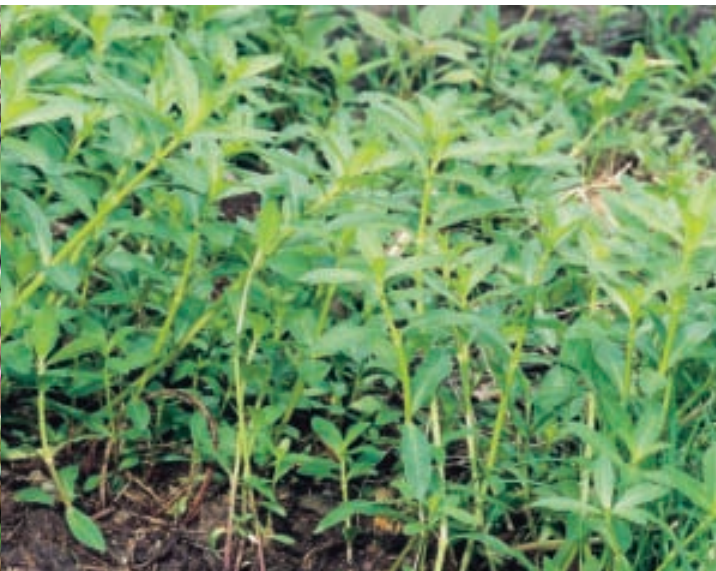
The weed forms herbaceous stands.