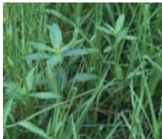
(Top) Alligator weed competes for light and space in pastures.