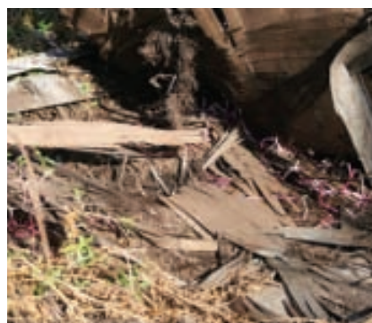
Whitish stems under flood debris appear to be rhizomes, but are more likely to be stolons (above-ground creeping stems).

Alligator weed is often referred to as having underground rhizomes. It is, however, thought that what appear to be underground rhizomes are either thickened roots, or stolons (above-ground creeping stems that root at nodes) that have become buried in silt and sediment over time. The whitish creeping underground stems are either new shoots making their way to the surface or old stems that have been buried over time.