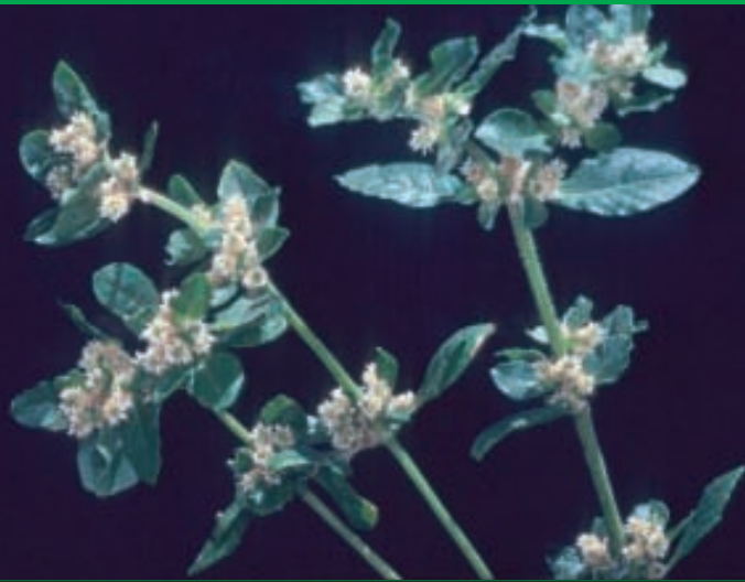
Alternanthera nana.