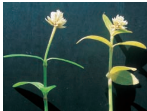
Stems have pairs of leaves at each node.