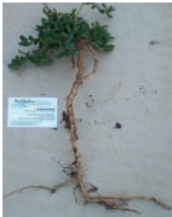
Roots will penetrate into the soil and have been found more than 1 m from the surface.