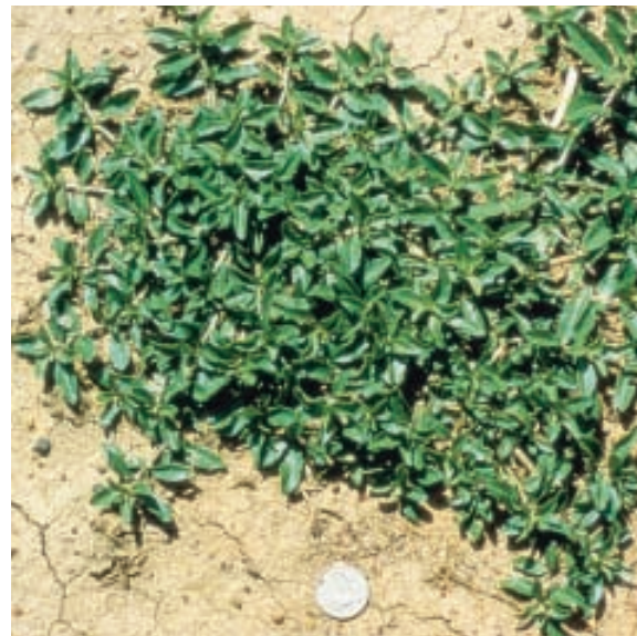
Slower, prostrate growth can continue in dry conditions.