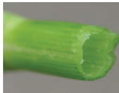
Stems are hollow when mature.