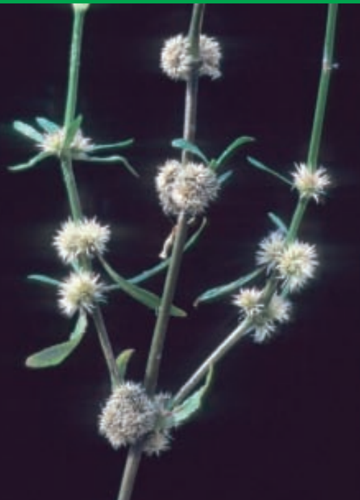
Alternanthera nodiflora.