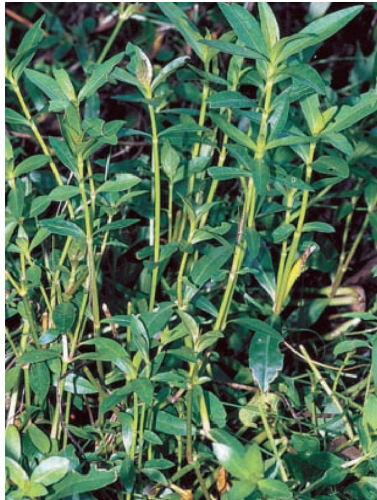
Vertical stems are dark green.

Leaf size and shape vary considerably with growth habit and conditions. Leaves range from 2 to 12 cm in length and 0.5 to 4 cm in width, usually with an acute tip.