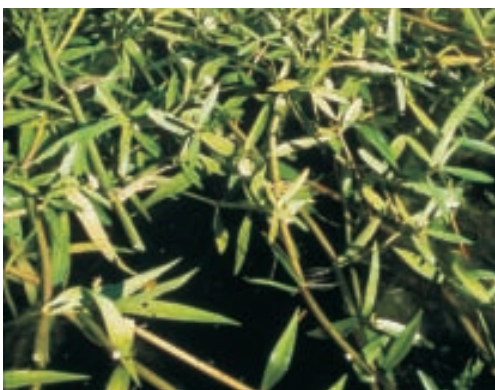
Floating stems extend across the water.

Under aquatic conditions alligator weed competes successfully with most species, with the exception of water hyacinth. In pastures its creeping habit and tendency to form dense mats allows it to compete successfully for light and space. It can become dominant in wetter sections of pastures. Grasses will usually predominate on slightly elevated areas.