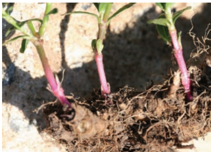
New shoots coming from very dry root material.