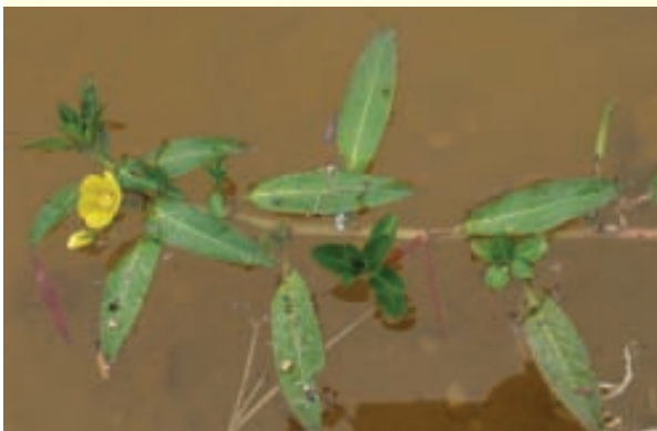
Water primrose.