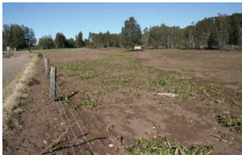
Alligator weed and water hyacinth spread by the recent flooding of the Hunter River.

Accidental spread occurs commonly through human activities (on earthmoving machinery and watercraft; through the slashing and mowing of infested areas; in mulch, gravel extraction and turf; and even through