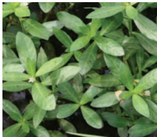
Glossy, dark green leaves.