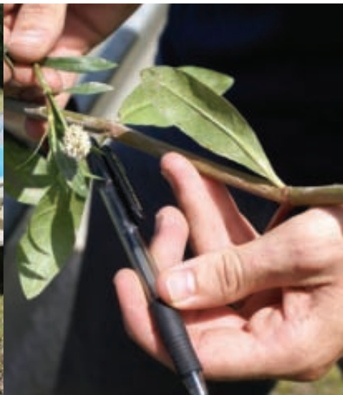
Larger leaves and elongated stems of an aquatic plant.