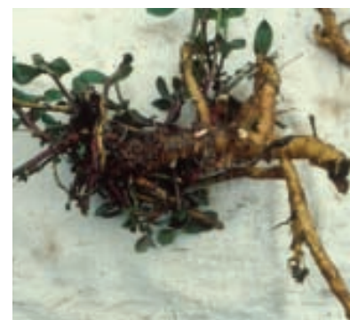
Roots become thicker, starchy and rhizome-like in soil.