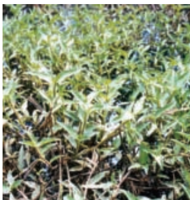
Infestations generally consist of a tangled mat of older stems supporting younger upright stems.