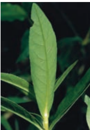
Leaves are generally spear shaped, but size and shape can vary considerably.