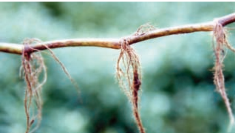
Filamentous roots can occur at each node along a stem.