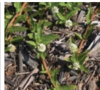
Brownish red prostrate stems.