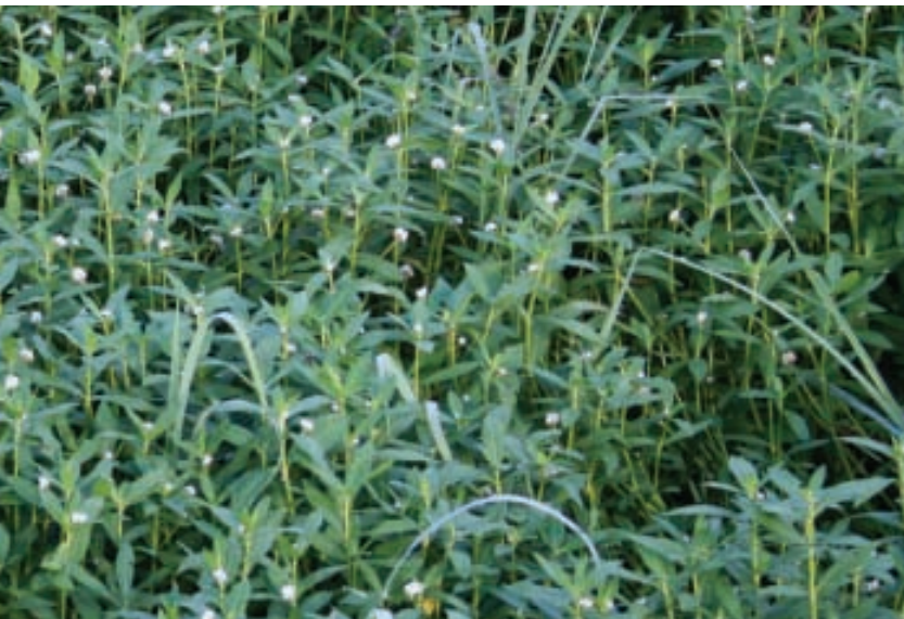
Erect summer growth.