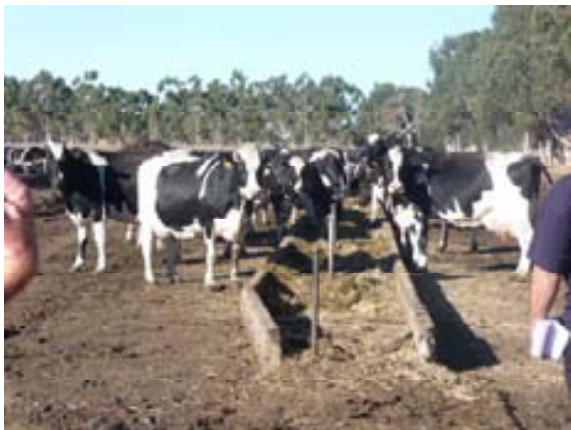
Simple troughs can minimise feeding out waste

After looking forward to a good season this year the devastating flood events on the Far and Mid North Coast has placed many dairy farmers into an enforced feedlot situation for the coming weeks. In this situation, it is essential to go back to nutrition basics to maintain cow health and place milkers in the best position to continue production through the winter.