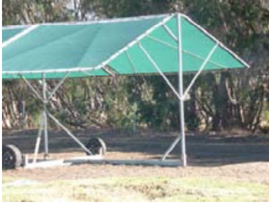
Portable shade shelters at Vasse Research Centre, WA

Some of the common features that impressed me about the farms we visited were: