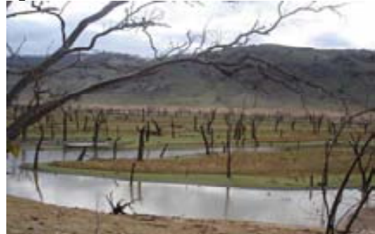
Upper reaches of Hume Dam May 2009

dairy would have sufficient space for the milking herd, as well as access to the dairy and stored feed for five days. Working from the SES headquarters during the flood and responding to the farming enquiries gives you a real appreciation of how well prepared dairy farmers are for natural disasters compared to other agricultural industries.