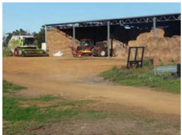
Feed storage on a typical WA dairy

Other locations for Topfodder courses could be organised contact your local NSW DPI office for further information.