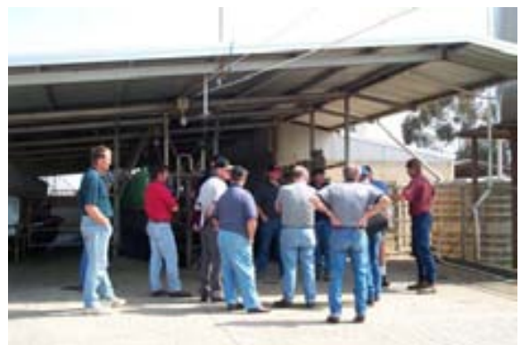
People Focus Groups create a plan to improve all aspects of people management on the farm.