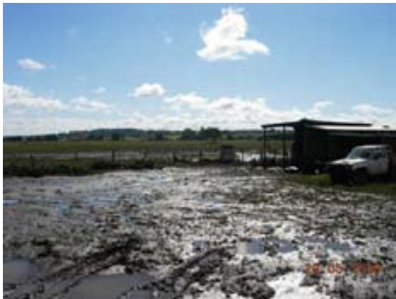
The aftermath of flooding at a Kempsey dairy farm in May.

With most of the Far and North Coast of NSW under water in the past few months it is timely to remind ourselves of the ways to reduce the problems associated with mastitis caused by wet weather and flooding.