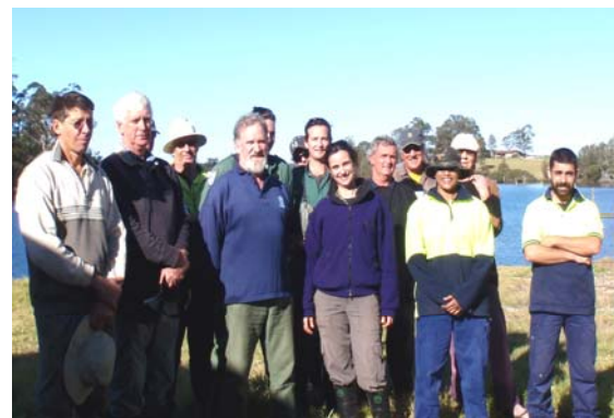
Pacific oyster control day Wagonga Inlet June 2010

Pacific oyster working bees were held on the Clyde River on 22 May 2010 and at Wagonga Inlet on 19 June 2010. Oyster farmers teamed up with the Southern Rivers Catchment Authority, Wagonga Rangers, I&I NSW and Batemans Bay Marine Park Authority to remove the pest from hotspots, mainly along estuary foreshores.