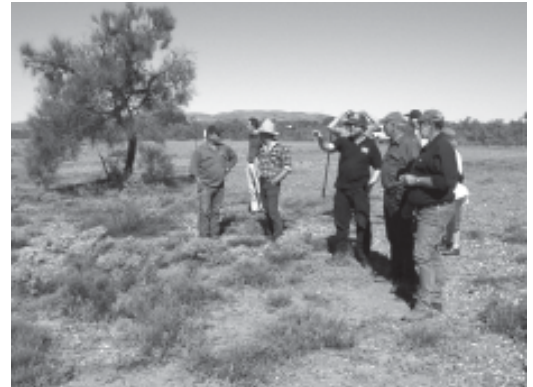
Participants discuss the ecology of arid lands and its implications for agroforestry.

Day one looked at the type of things participants wanted to learn from the